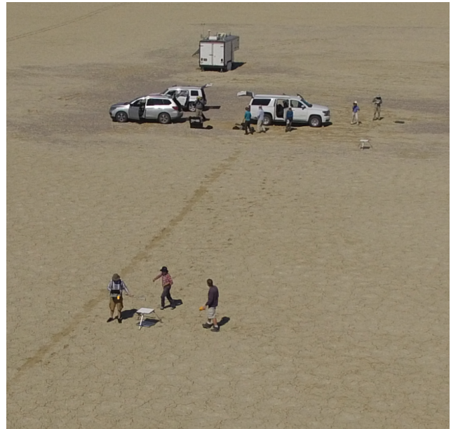
Fig 1. A panel measurement with the field spectroradiometer at Railroad Valley Playa site being performed for the east-west stop and measure experiment.

Only data from a continuous measurement transect collected in the morning is presented here. The data showed that during the morning collections the reflectance of the surface increased from the first collection heading out to the east in comparison to the last collection heading back to the panel (westward), as shown on Fig 2. There is a steady increase in overall albedo of the spectra throughout the measurement.