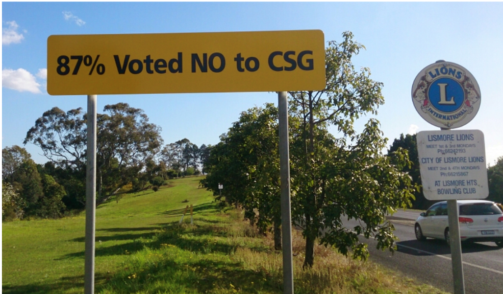
Figure 2: One of five signs erected by Lismore City Council to advertise the CSG poll result; this sign was still standing at the entrance to the City a year after the poll.