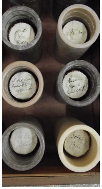
I did not know till afterwards, an installation by Holly Pester at Text Festival, 2011