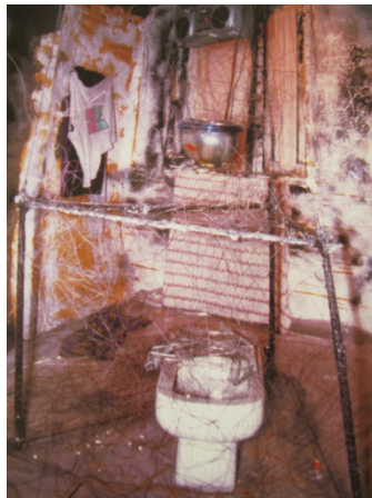
Fig 3. Taghizadeh, Jinous. Aquarium, 2001, a CD by contemporary art museum of Tehran