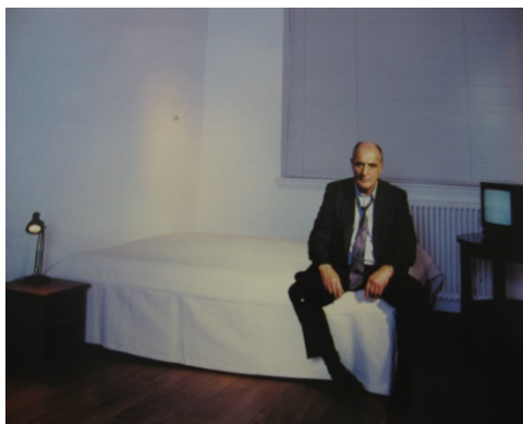
Fig 5. Tabrizian, Mitra. Beyond the boundaries, 2000, photo from Herfeh: Honarmand Magazine, No. 11, spring 2005, P. 93.