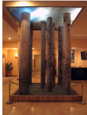
Fig 2. Yadolahi, Arash. Untitled, 2001, a CD by contemporary art museum of Tehran