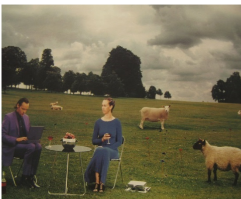
Fig 6. Tirafkan, Sadegh & Hassanzadeh, Khosro. Ashoora, 2001