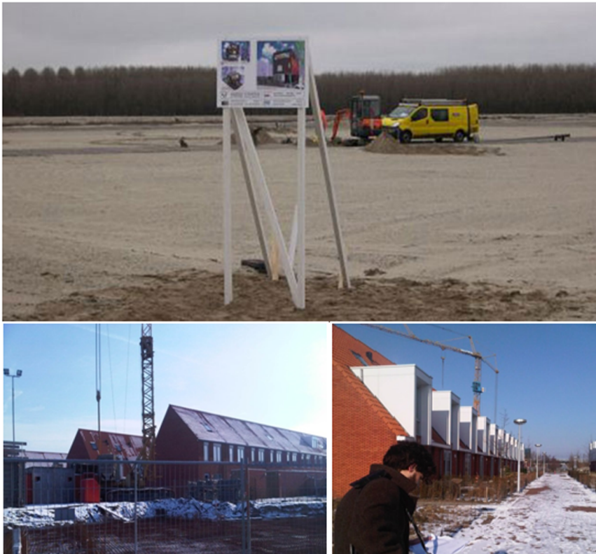
Figure 1a-c. Photo impression of the emergence of a so-called VINEX location. Figure 1a at the very start, Figure 1b after three and Figure 1c after seven months

Our illustration takes an important yet rarely tested assumption in collective action literature serious, namely the cruciality of a collectivity in the context of collective action. If indeed collective action is collective by nature, one would expect that—given that all inhabitants start with zero contacts when they enter the community vi —the inhabitants who have more informal contacts at t_0 (= one month after entering the neighbourhood) participated more in community related collective action. After all, if all start with 0 contacts, the networks of those people who have more contacts after one month must, by definition, have grown faster than people who have less contacts. We expect that participants and non-participants in protest will differ on the previously described antecedent of collective action: grievances, efficacy, and identification. Most important, as social networks are crucial for the emergence of shared grievances, efficacy, identification and emotions, we expect that informal embeddedness works as a catalyst for the social psychological antecedents of collective action.