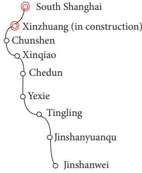
FIGURE 2: The route map of Shanghai Metro Line 22.

station i to station j ; D_{ij} is transport capacity; Tz is time of cycle operation diagram; n_{ij} is amount of trains from station i to station j ; n is the total amount of cycle; \mu_{pq} is the amount of passengers who get on at the former station p and get off at the next station q ; R is all types of trains; x_{ijr} is the amount of times of stop of trains from station i to station j ; f_r is the frequency of corresponding trains; h , \tau_s , and \tau_q are average stop time, stop time, and the additional time due to start/stop.