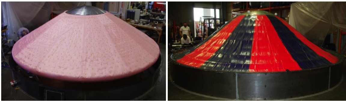
Figure 2- 6m HIAD with TPS (left), under 50,000 lbs of static load (right)