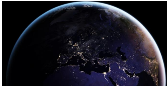
Figure 2. NASA Black Marble composite images for year 2016 provide full-hemisphere views of Earth at night. Natural surfaces, clouds, and sun glint — added here for aesthetic effect — are derived from the MODIS Blue Marble Next Generation Imagery products.

Processing Systems (Land SIPS) in 2018. The VNP46 product is available at 500 m resolution since 19 January, 2012 with data from the Suomi-NPP and NOAA-20 VIIRS DNB sensors. The retrieval algorithm, utilizes all high-quality, cloud-free, atmospheric-, terrain-, vegetation-, snow-, lunar-, and stray light-corrected radiances to estimate daily nighttime lights (NTL) and other intrinsic surface optical properties.