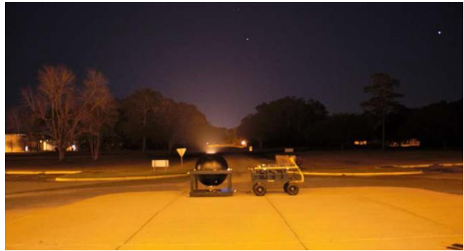
Figure 3. Initial deployment of Ground-based Accurate Active Light Source (AALS) for radiometric calibration of the VIIRS DNB's High Gain Stage (Image Credit: Robert Ryan NOAA-SBIR/IIR, Inc.).

Initial assessment activities are aimed at evaluating NASA's Black Marble product suite at several locations and time periods, representing different retrieval conditions and assessing the uncertainty of seasonal effects due to vegetation seasonality and snow cover, temporal aggregation, and the impacts of these effects on datasets and products that are directly called for by GEO's Work Programme. This also includes end-to-end analyses of downstream product impacts, due to sources of measurement error in the nighttime lights data, to help expose discrepancies that affect GPW4 (Gridded Population of the World version 4) estimates [26], as well as other datasets produced from additional demographic and mobility layers, e.g., the American Community Survey (ACS), and the Puerto Rico Community Survey (PRCS). These datasets, which are currently provisioned by team members at NASA's Socioeconomic Data and Applications Center (SEDAC), also as part of GEO's Work Programme, must be thoroughly assessed to generate accurate estimates of populations at high frequency time intervals [27].