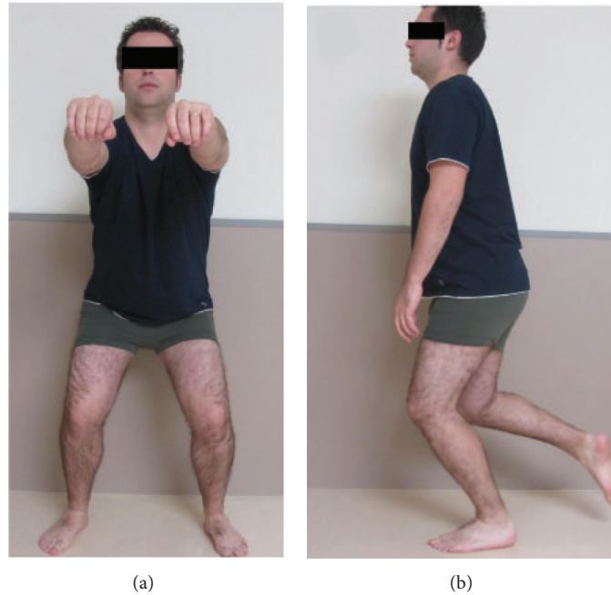
FIGURE 1: Closed kinetic chain exercises on stable surface: (a) bilateral semisquats; (b) one leg standing exercise.

2.3. Randomization. Following the baseline examination, patients were randomly assigned to receive proprioceptive/strengthening exercise program alone (control group) or proprioceptive/strengthening exercise program combined with TrP-DN into the lateral peroneus muscle (experimental group). Concealed allocation was performed using a computer-generated randomized table of numbers created prior to data collection by an external researcher. Individual and sequentially numbered index cards with the random assignment were prepared. The index cards were folded and placed in sealed opaque envelopes. A second external researcher opened the envelope and proceeded with treatment according to the group assignment.