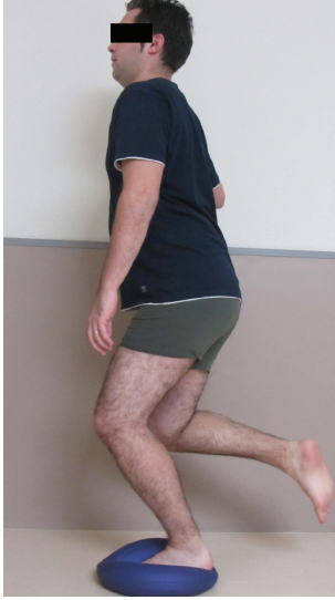
FIGURE 2: One leg standing exercise on unstable surface.