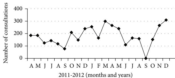
FIGURE 1: Monthly distribution of consultations ( N = 3808 ) from April 1, 2011, to December 31, 2012.

3.1.1. Trainees’ Evaluation of the Use of Telemedicine. Findings from the candidates’ evaluation of the use of telemedicine are shown in Table 1. All respondents agreed to varying degrees on the high importance of telemedicine to their patients’ care.