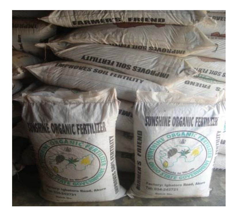
Figure 2: Organic Fertilizer Produced By OSIWRTP

(b) Turning plastic waste to wealth: Nylon/plastics contribute to the increasing volume of solid waste in Akure. In 2004 (Sridhar et al 2004), Nylon/plastics amounted to about 15.72% of the total waste generated in Akure. In the plastic waste streams, polyethylenes and polypropylene form the largest fractions, followed by Polyethylene terephthalate (PET) which are presently not being processed. Lesser amounts of a variety of other plastics are also found in the plastic waste streams. In Akure, recycling of plastics involves mechanical recycling processes whereby plastics are shredded to smaller particles and are converted to pellets (Figure 3). These pellets are sold to other recycling companies in Lagos, Oyo and Anambra States for further processing. Increasingly, it is becoming difficult for the Project to meet high market demands for Pellets..