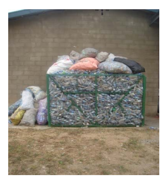
Figure 3: Piles of Plastic for Recycling