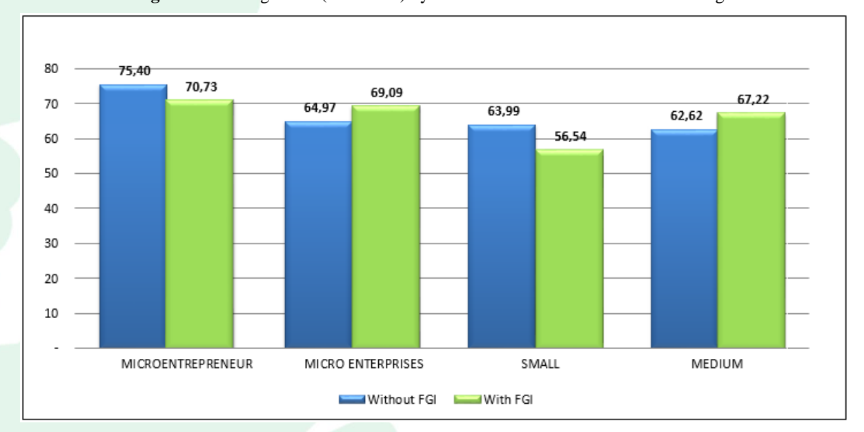
Figure 3 - Average term (in months) by firm size with and without FGI coverage

that does not fully confirm the expected results, as showed by Figure 3.