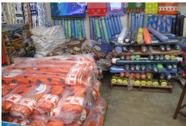
Figure 8. Mapeto DWSM Ltd. Store, Blantyre, Malawi

Since the early days of commercial production in the late 1920s imported printed cloths from Tanzanian factories have had a large market share in Malawi. However, the production of the majority of the party cloths comes from a textile factory in Blantyre, the commercial centre of the country. In 1957, as colonial rule came to an end, British textile manufacturers David Whitehead & Sons opened a state run textile factory. They shifted production from England as textiles could be produced more cheaply locally and the local factory was more able to produce new designs quickly and efficiently. Since 2003 the factory has been run as a limited company known as Mapeto (DWSM) Ltd and continues to have facilities for raw cotton cleaning, spinning, weaving and printing. However, cotton growing in Malawi cannot keep pace with demand for processed cotton cloth, and today the company imports plain cotton fabric from abroad, with the cheapest imported from China, which is then printed at the factory and marketed throughout the country (Giglio 2010:7).