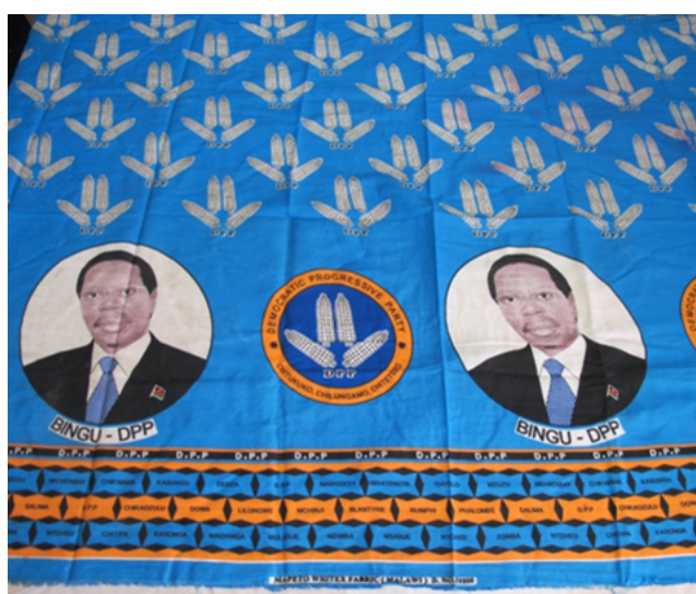
Figure 6. (left) United Democratic Front political cloth ©National Museums Scotland Figure 7. Democratic Progressive Party political cloth ©National Museums Scotland

Issues regarding political cloth had also hit the headlines a year earlier. Political analyst Jimmy Kainja drew attention to the fact that three years after the 2009 election victory for the Democratic Progressive Party (DPP), President Mutharika had still failed to honour his promise to reveal the names of the business men and women who helped the party with campaign materials including t-shirts, cloths and flags, resulting in the countries zero scoring on party funding accountability (Kainja 03/04/2012). In the run up to the elections the majority of political cloths are distributed free during promotional events, although the cloths of the UDF, MCP and DPP can also be purchased in Blantyre’s textile shops alongside other fashion cloths. Interviews we conducted in Blantyre market also indicated that a certain amount of freely distributed party materials were being sold on by individuals for profit. Whilst this cloth functions as a tool of propaganda, unlike printed paper pamphlets and posters, it has a lasting life as an item of clothing. With ownership, it is taken into the voter’s homes, into the domestic space as personal property, crossing from the public into the private sphere. In a country where so many live on very limited resources, where the cloth is distributed without cost, such a gift becomes a powerful tool for political engagement.