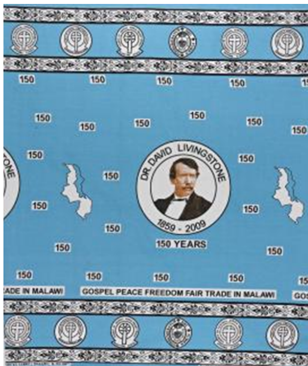
Figure 9. (left) CCAP Women's Conference cloth 2012