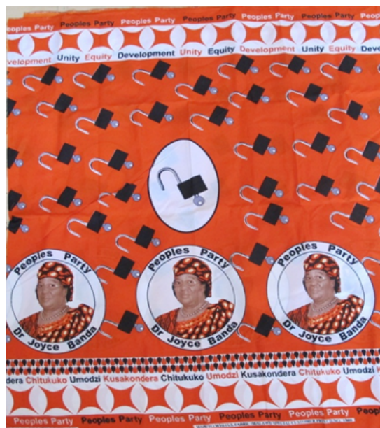
Figure 3. Peoples Party political cloth