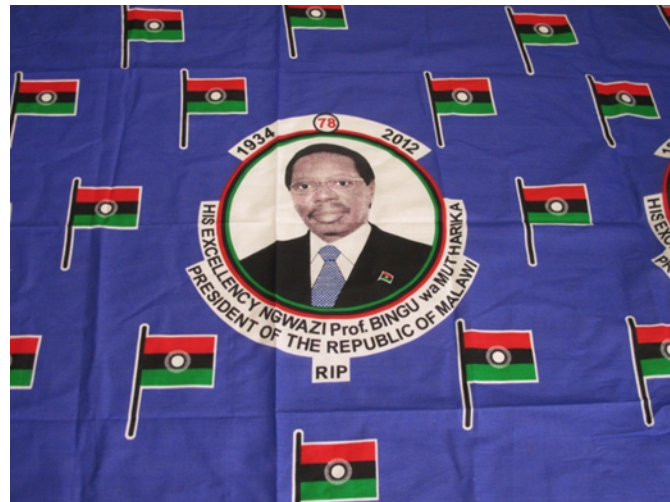
Figure 1. (left) Map of Africa highlighting Malawi ©National Museums Scotland Figure 2. Presidential funeral cloth 2012 ©National Museums Scotland

In this funeral cloth both political and religious spheres merged in a cloth which signified recognition and reverence for a life lived, the end of a political era and a new beginning. As a culturally recognised method of commemoration this cloth chronicled an event with national impact. In life, whilst Mutharika had been leader of the Democratic Progressive Party his portrait had featured on the party's campaign cloth, and his photograph was hung in shops and offices throughout Malawi, and this new cloth ensured a long lasting memorial.