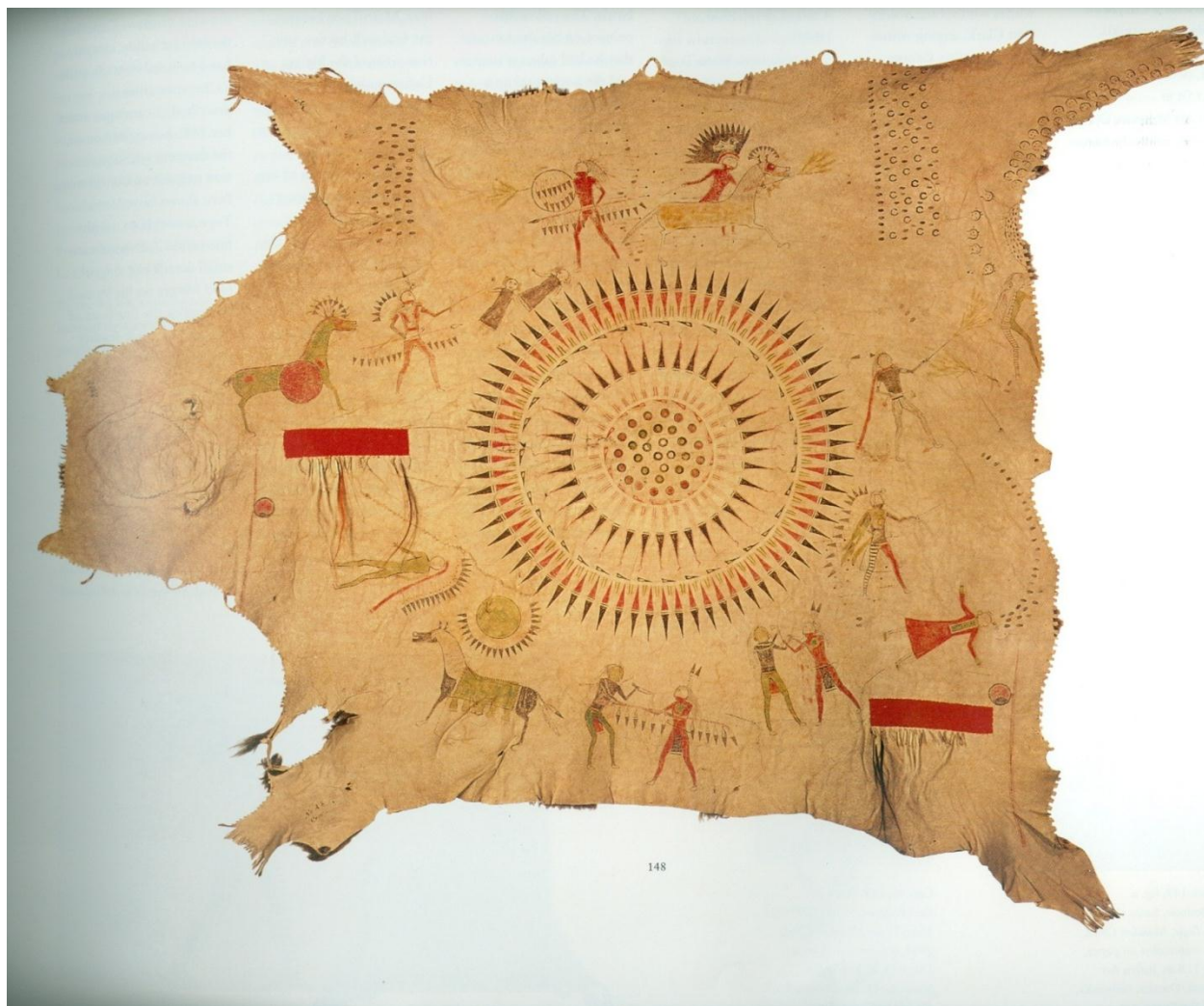
Mato-Tope robe, 1835, Bern Historical Museum