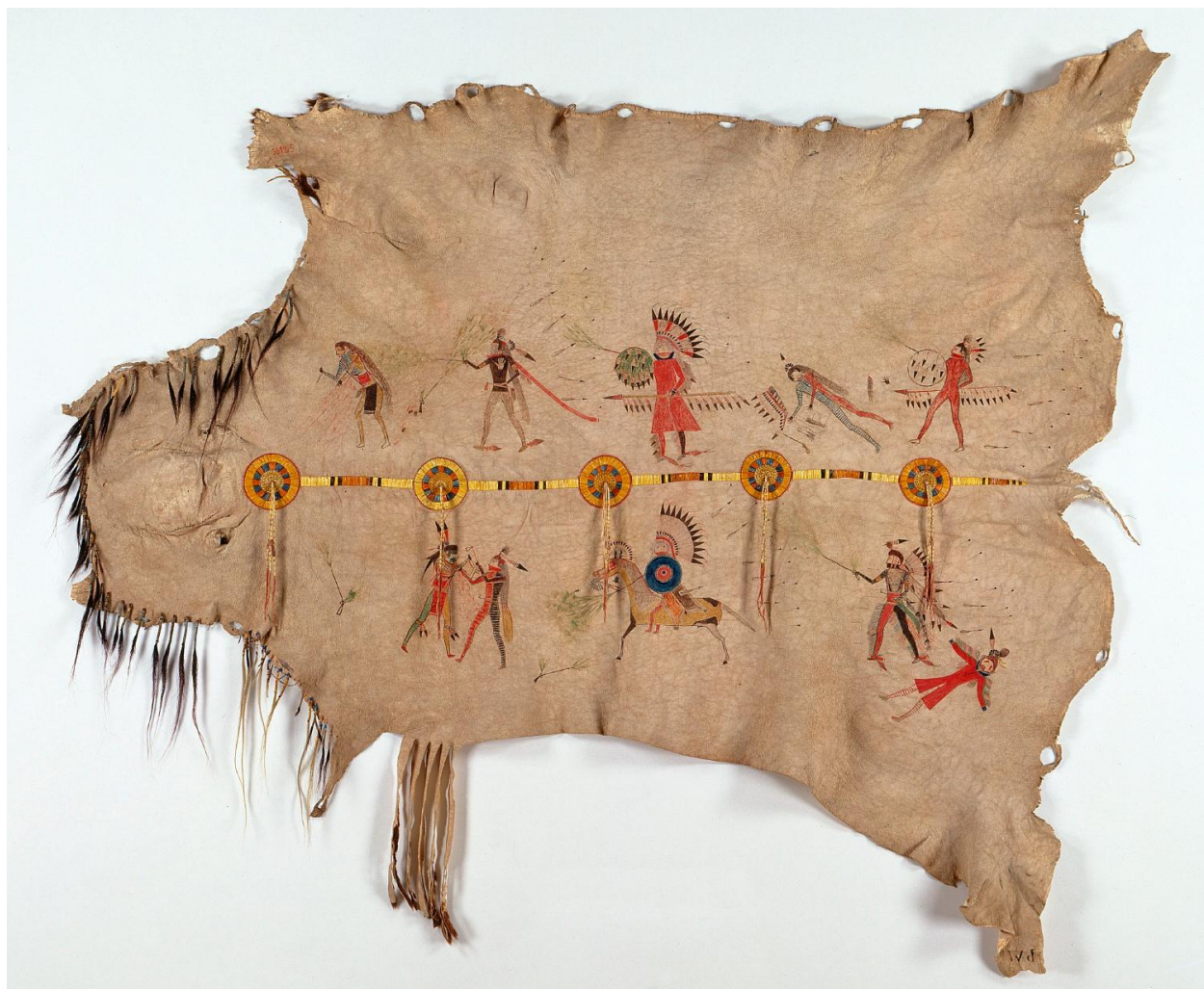
Mato-Topo Robe, Linden-Museum Stuttgart