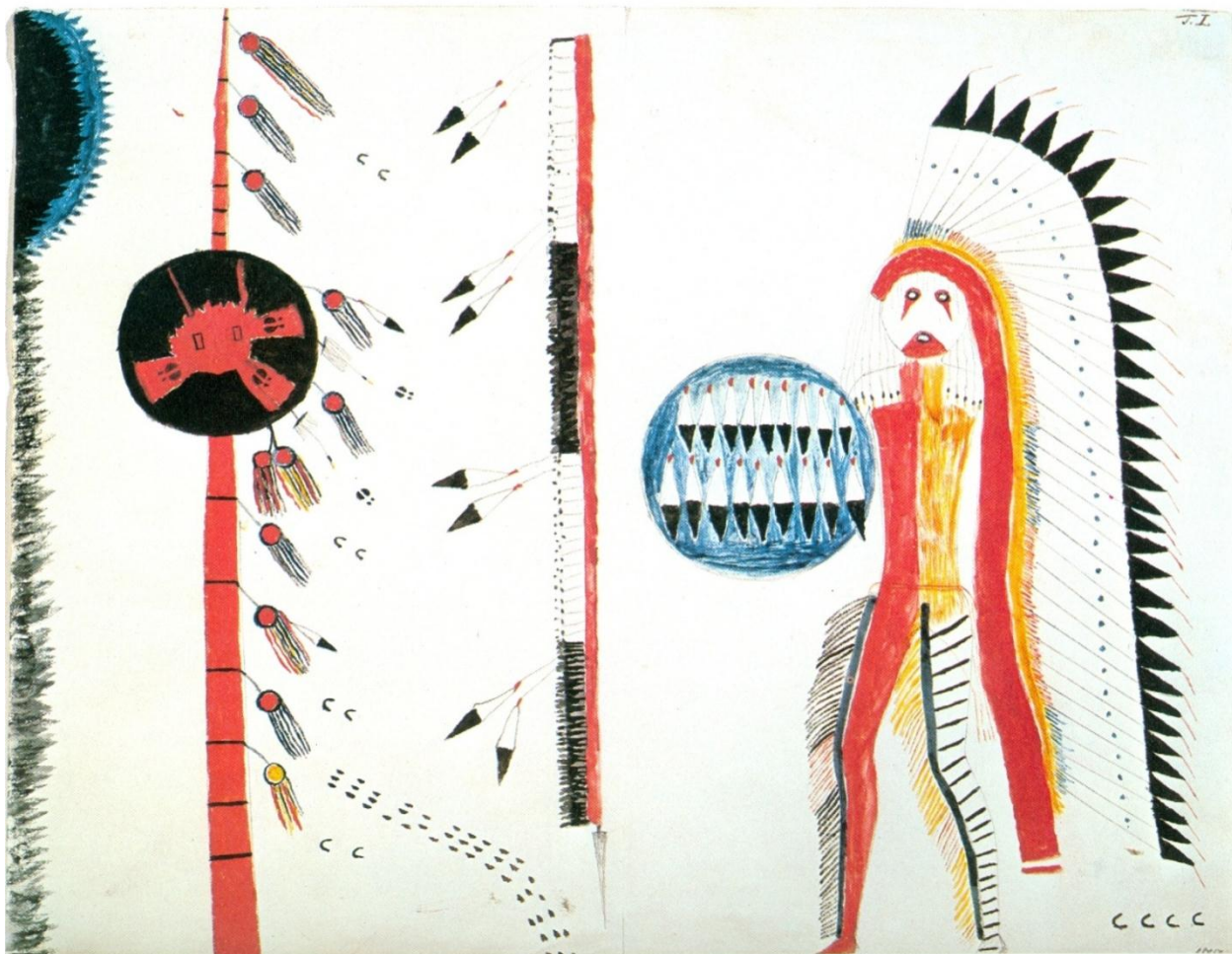
Attributed to Mató-Tópe (Four Bears), Native American; Mandan, -1837, Mato-Tope: Self-portrait; holding feather-covered shield, with pair of ceremonial lances thrust into ground ), watercolor on paper, Joslyn Art Museum, Omaha, Nebraska: Gift of the Enron Art Foundation, 1986, 1986.49.318