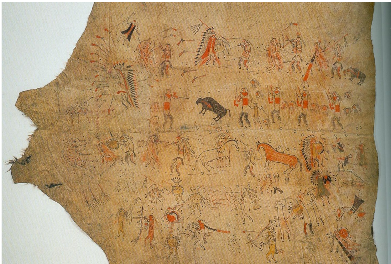
Painted bison robe, Sioux.

Kohler collection 1846. Inv.Nr. IV B 208