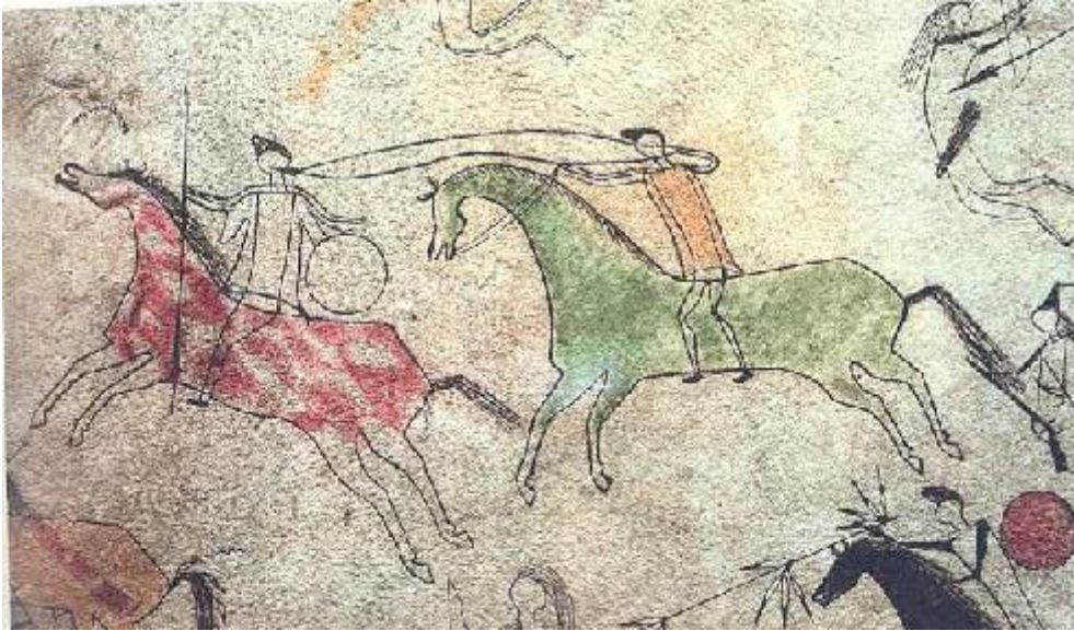
Cheyenne combat scene, detail of a buffalo robe, 1845, Deutsches Ledermuseum

Keyser, James D. The Five Crows Ledger: Biographic Warrior Art of the Flathead Indians . Salt Lake City: University of Utah Press, 2000. Page 13.