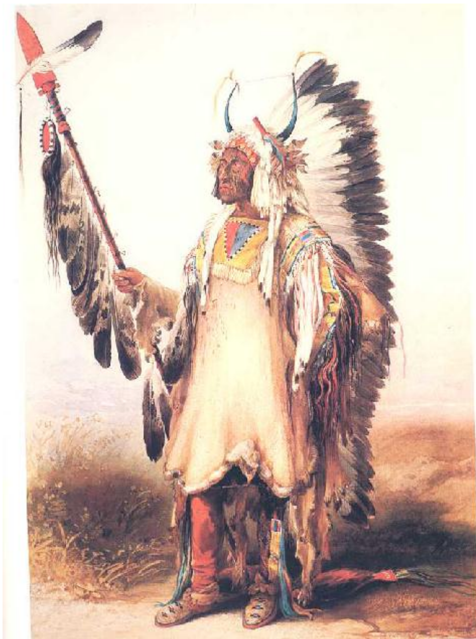
Karl Bodmer, Mato-Topé: Mandan Chief , watercolor on paper, 1834. Gift of the Enron Art Foundation. R16. Joslyn Art Museum, Omaha, Nebraska.