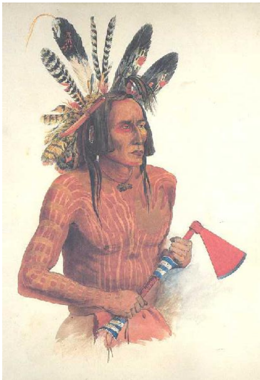
Karl Bodmer, Mato-Topé: Mandan Chief, watercolor on paper, 1834. Gift of the Enron Art Foundation. NA117. Joslyn Art Museum, Omaha, Nebraska.