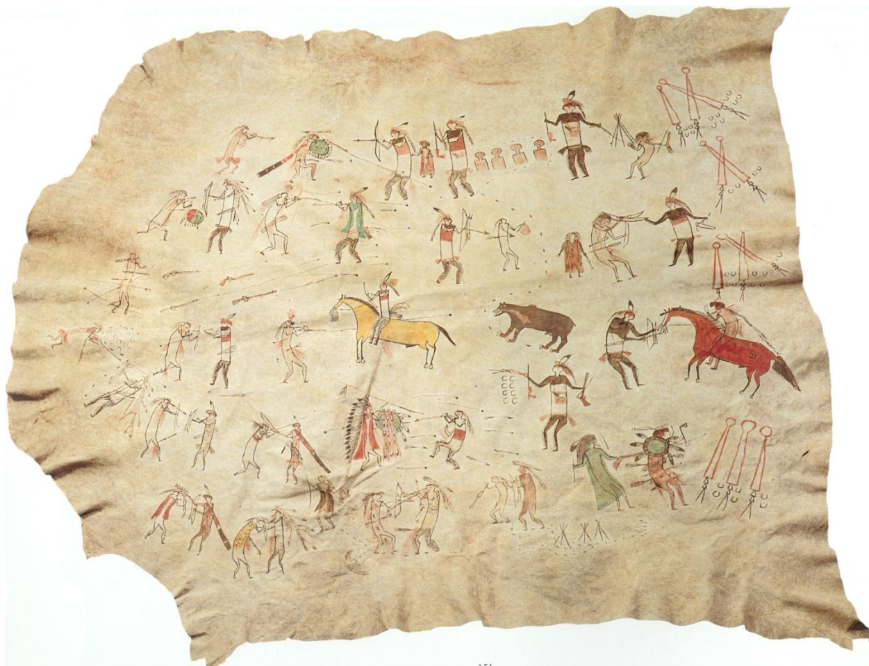
Robe with War Exploits, Upper Missouri, 1830s,