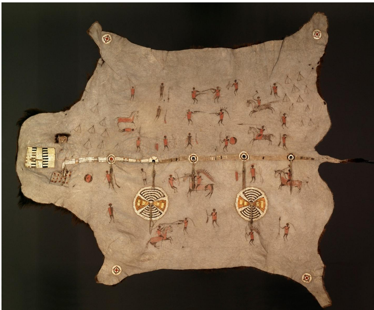
Hidatsa Robe, 1830, Linden-Museum Stuttgart