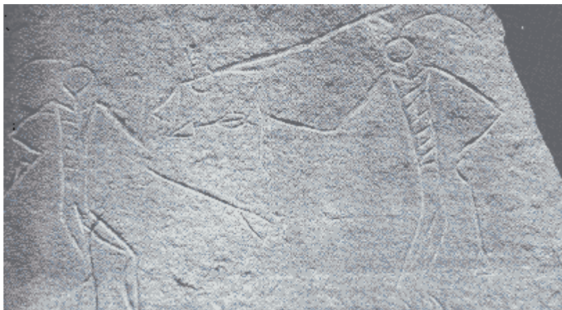
Crow warrior's coup, Castle Butte, Montana, late 1700s