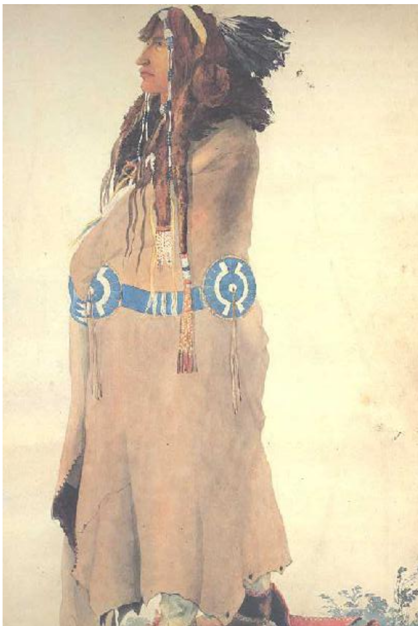
Karl Bodmer, Sih-Chida (Yellow Feather), 1833