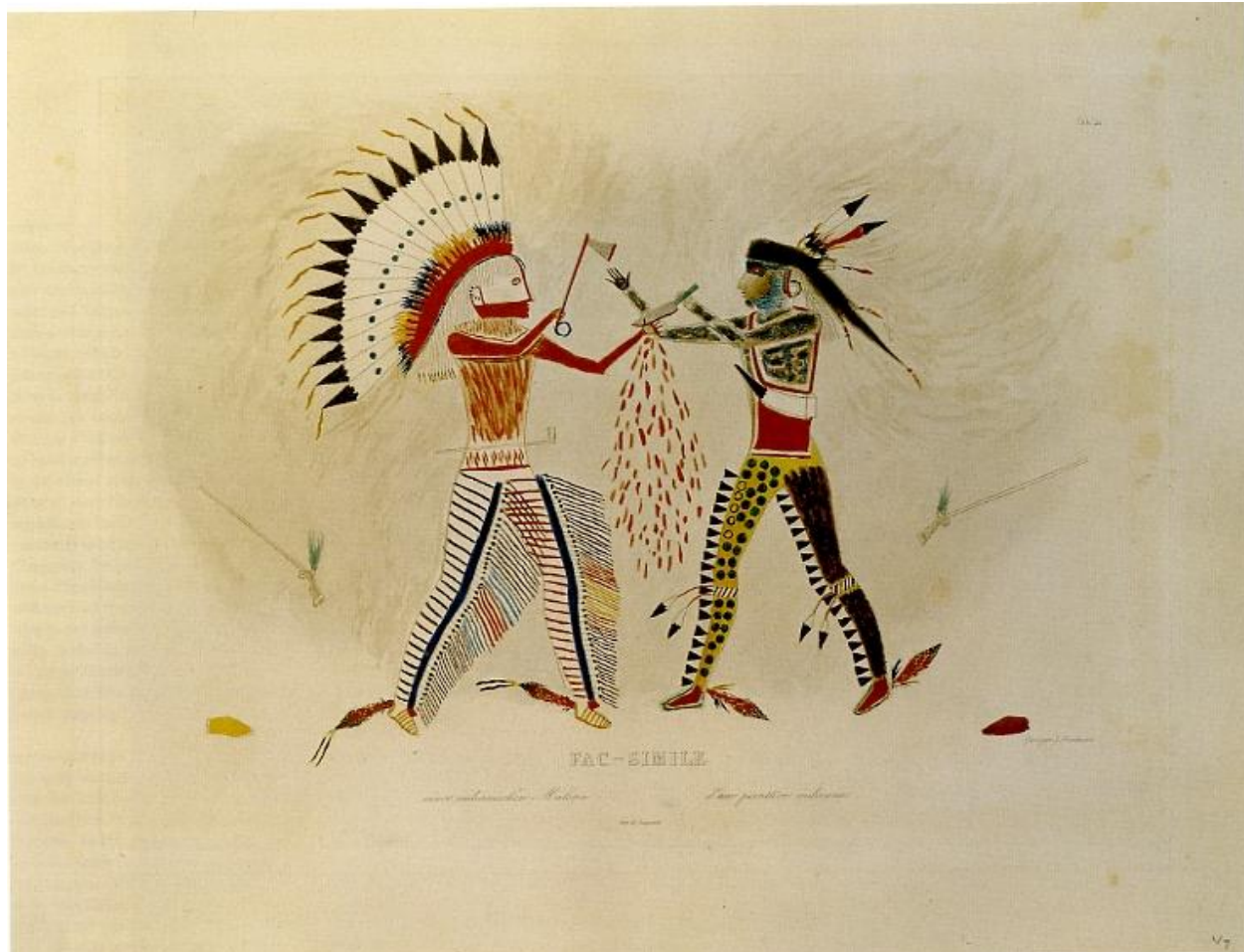
Mato-Tope, Battle with a Cheyenne , paper, pencil, watercolor, 1833. Gift of the Enron Art Foundation. R17. Joslyn Art Museum, Omaha, Nebraska.