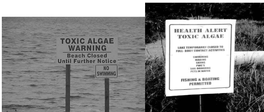
Fig. 3. Posting of warning signs at lake beaches and boat ramps. (See Color Plate 4).

Fig. 2. (cont.) Weekly updates to microcystins sampling results and health alerts on the NDEQ website ( www.deq.state.ne.us ).