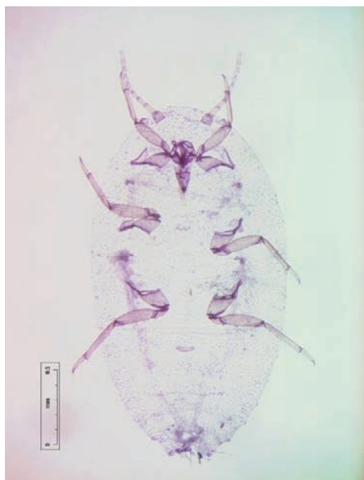
FIG. 1. Microscopic permanent slide of adult female of Phenacoccus peruvianus .

Mealybug specimens were collected from diverse host plants of Portugal, Spain, France, Italy and UK. Samples were slide-mounted (Fig. 1) according to the procedure detailed by Williams and Granara de Willink (1992) with a few modifications made by the different authors depending on their own preferences. Specimens were identified using the keys of Granara de Willink and Szumick (2007). Communication between European specialists was entailed during the identification process.