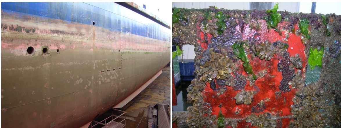
Figure 2.1 Examples of biofouling

'when weeds, ooze, and filth stick upon its sides, the stroke of the ship is more obtuse and weak; and the water, coming upon this clammy matter, doth not so easily part from it; and this is the reason why they usually calk their ships' (Plutarch, 2013).