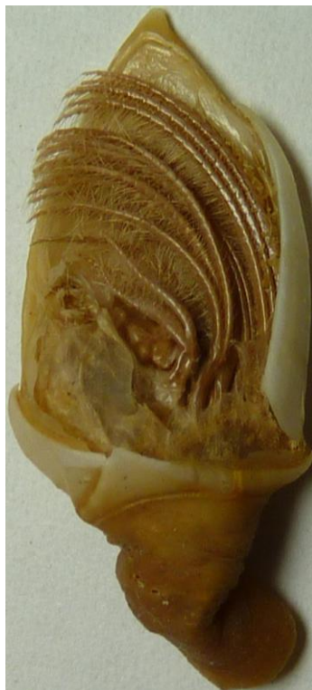
Figure 2. The stalked barnacle Smilium zancleanum (Seguenza, 1876), with plates on the right-hand side removed to show the cirri. The resemblance to a bird’s wing is evident, although it clearly lacks a bird’s head. Length of barnacle 30mm [48].

None of this implies that Gerald or his contemporaries got it right, for important questions remain: e.g., how did medieval people sustain a belief in things they could see, with things they could not see but believed to exist? This represents a conceptual schema at work in the medieval trope of the world—as the book-of-nature worked to represent the visible world as: