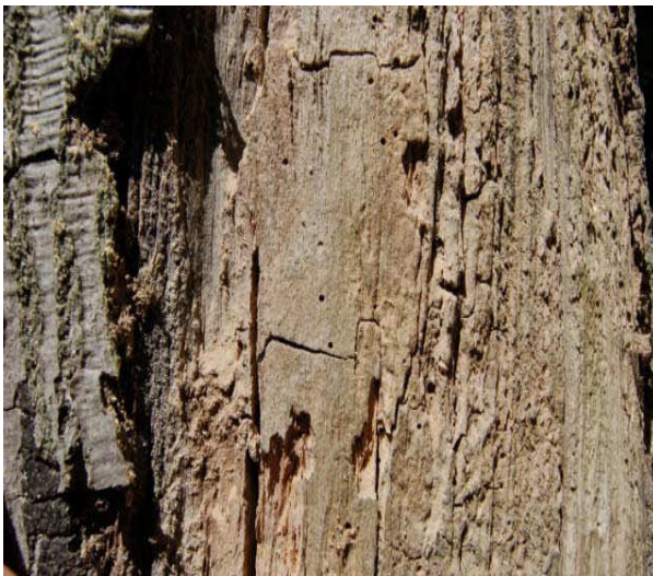
Figure 4. Small boreholes in a dead ash Fraxinus excelsior tree used as nest locations by Chelostoma campanularum

Long-term conservation: There has recently been extra attention given to conservation of red helleborine in the UK. As well as ongoing habitat management, seed has been collected over recent years: some has been banked at the Millennium Seed Bank at Wakehurst (part of Kew Gardens) in Sussex, southern England; some has been used for DNA analysis of the UK populations; and some has been used for propagation purposes. Botanists at Kew and Natural England are continuing to research improved methods of germination and propagation (as yet unsuccessful) with a view to producing plants that may be used for reintroduction purposes.