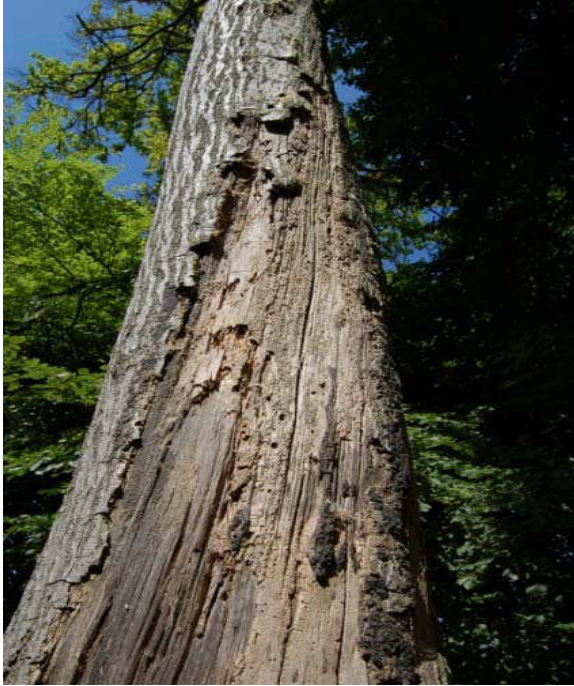
Figure 3. Standing dead ash Fraxinus excelsior trunk – valuable habitat for solitary bees and wasps

exclosure was cleared of bramble Rubus fruticosus and ash seedlings and the ground lightly scarified by hand-raking to remove the cut material and accumulated leaf litter.