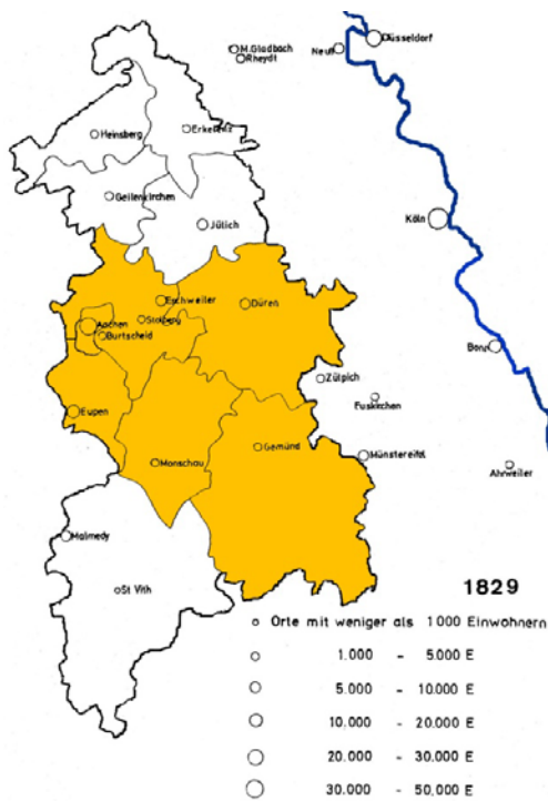
Map 2: Industrial district of Aachen, counties with a majority of industrial employment

Note: The county of Gemünd became later county of Schleiden.