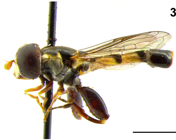
Fig. 3. Syritta austeni Bezzi, 1915, overall appearance, lateral view. Specimen collected on Réunion, France. Scale bar: 2 mm.