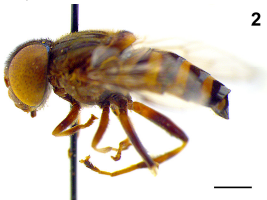
Fig. 2. Eristalinus (Lathyrophthalmus) madagascariensis (Hervé-Bazin, 1914), overall appearance, lateral view. Specimen collected on Réunion, France. Scale bar: 2 mm.

Notes. The studied specimen from Réunion was collected in an upland forest.