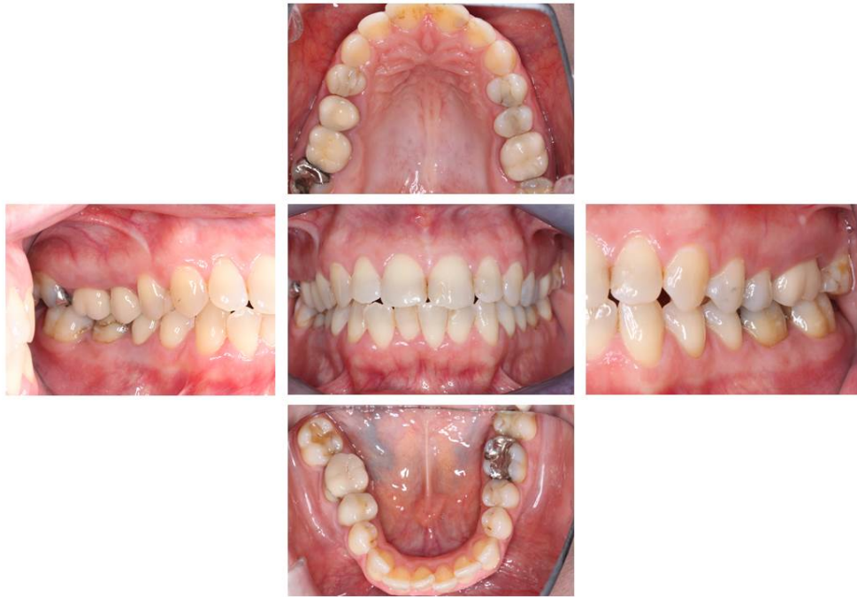
Figure 1: Initial intraoral view