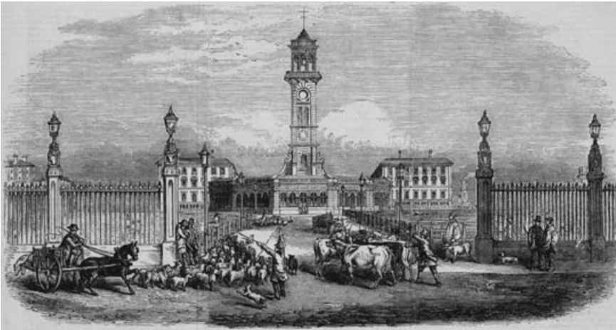
III. 3: The Metropolitan Cattle Market, Islington, was opened in 1855 by the Prince Consort to replace Smithfield. Despite a location adjacent to the Great Northern Railway, drovers were still driving flocks and herds through city streets.