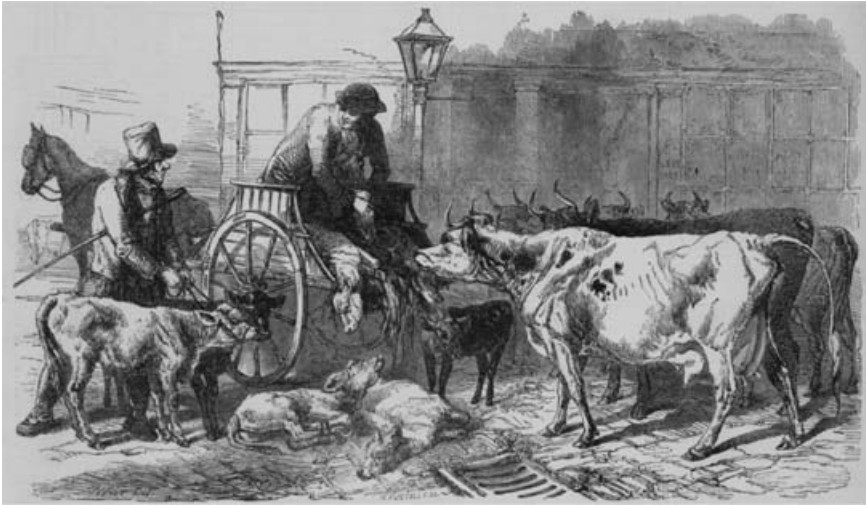
III. 1: A mature cow, likely from one of London's many dairies, sniffs at a dead calf in Smithfield Market, appealing to the sentimentality of the Victorian age and causing us to wonder if it is hers. The butcher in his two wheeled cart appears to be negotiating with a drover for two older bull calves. The sewer grate is evidence of improved sanitation in the market by mid-century.