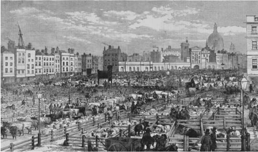
III. 2: While it could be typical of any market morning in the first half of the nineteenth century, this scene actually represents Smithfield Market's last day of operation before it was relocated to Islington in June 1855.