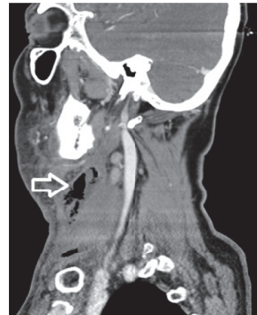
FIGURE 3: Sagittal neck CT image showing cervical subcutaneous gas (white arrow).

Meleney described subcutaneous tissue necrosis caused by streptococcus in 1924 and used the term of “streptococcal gangrene” [12]. It is known that necrotizing fasciitis shows different behavior in each area. Necrotizing fasciitis is divided into two subgroups in the head and neck region. The first group involves the eyelids and scalp, with infection generally developing after trauma. The second group is seen rarely and shows involvement of the face and neck. Although the most common etiologic cause is dental infections, other reasons include trauma, peritonsillar abscess, osteoradionecrosis, infections of the tonsils or the pharynx, injury, foreign bodies, cervical adenitis, surgical wounds, tumors, and salivary glands [11, 13]. In addition to these, sialoadenitis with ductal stones may lead to necrotizing fasciitis by forming abscess [11]. In our case, sialoadenitis with ductal stones was