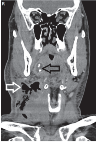
FIGURE 1: Coronal neck CT image showing cervical subcutaneous gas (white arrow) and right inflamed submandibular gland region with ductal stones (black arrow).