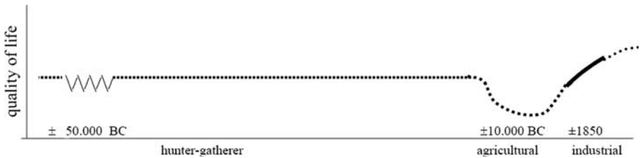
Fig. 5 Long-term trend in quality of life