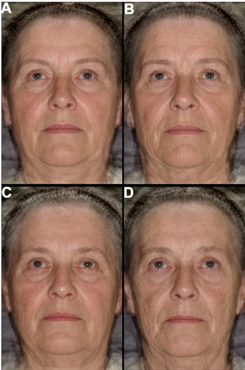
Figure 1. Composite images representing the effects of environmental factors on variation in perceived age between monozygotic twin sisters (upper images) and the effects of environmental and genetic factors on variation in perceived age between dizygotic twin sisters (lower images). a , Younger looking and b , older looking monozygotic twin sister composites (mean perceived age 64 [57–70] and 70 [60–85] respectively). c , Younger looking and d , older looking dizygotic twin sister composites (mean perceived age 64 [59–74] and 76 [69–84]). The older looking twin sister composites demonstrate signs of increased skin wrinkling, increased nasolabial fold shadowing (running from the lateral edge of the nose to the outer edge of the mouth) and, particularly for the non-identical twin comparison, a grayer skin color, a thinner face and reduced lip fullness. Each composite image was derived from 14 twin images and the chronological age was 67 [60–76] and 69 [61–79] for the monozygotic and dizygotic composites respectively; square brackets denote age ranges. doi:10.1371/journal.pone.0008021.g001

Hence, although sun-exposure causes an increase in the number of pigmented spots, it does so differentially depending on the skin type of the individual, which also determines whether they present alongside other signs of sun-damage such as skin wrinkling.