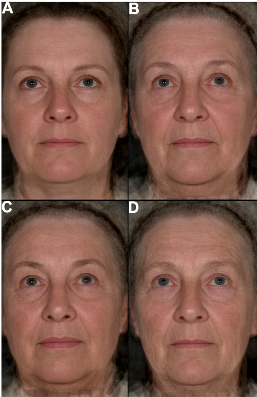
Figure 2. Composite images representing the average differences between 50 and 70 year olds (upper images) and 70 year old young and old looking subjects (lower images) in the British population. Composite images of a , 50 year olds (mean chronological age 50 [48–52]) and b , 70 year olds (mean chronological age 70 [68–72]). c , Young looking 70 year olds (mean perceived age 62 [57–68]) and d , old looking 70 year olds (mean perceived age 73 [67–79]) composite images. Differences in skin wrinkling and the nasolabial fold (upper and lower images) and lip fullness (lower image) are similar to those in the twin composites (Figure 1). The upper images were each derived from 18 female images and the lower images from 17. The mean chronological age was 71 [67–75] and 70 [66–74] for the young and old looking 70 year old composites respectively; square brackets denote age ranges. doi:10.1371/journal.pone.0008021.g002

technique (SI Discussion). Hair graying and hair thinning but not hair recession were found to be significantly correlated with how old the Danish twins looked for their age in the passport-type images (Table 1 and also SI Fig. S1). Hair recession was not in evidence in some of the passport-type images due to subjects' hair-styles. This could account for the lack of any significant correlation between hair recession and perceived age (Table 1). There was also no significant correlation between the hair features and