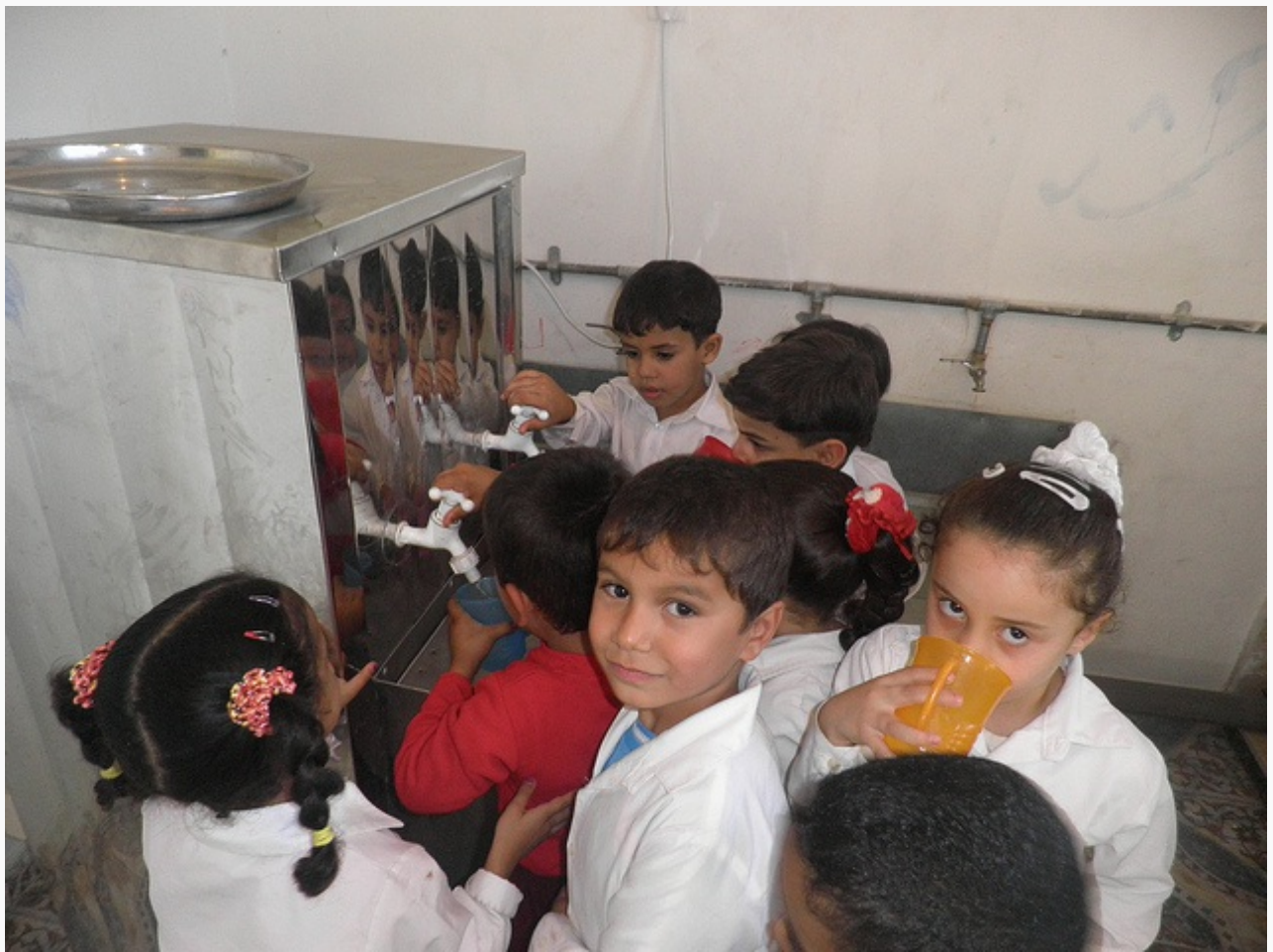
Children drinking clean water in Jabalia refugee camp in Gaza thanks to a water purification and desalination unit funded by the Lee & Gund Foundation.