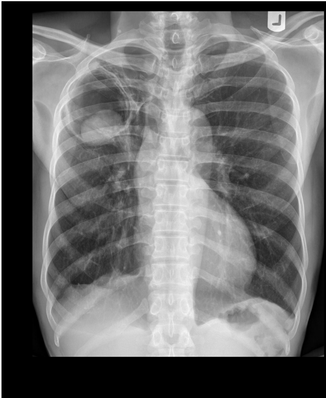
Figure 1. Chest radiography showing a fungus ball with an air crescent in the right upper lobe. doi:10.1371/journal.pntd.0002352.g001

A. fumigatus [1,3]. Chest radiographies show intracavitary mass (fungus ball) with an air crescent (Monod sign) in about two-thirds of the cases [2,4]. This pattern is mostly localized in the upper lobe and can change position with gravity like in our radiographies. Computed tomography can be useful to detect smaller lesions that may not be apparent on conventional radiographies. An increase of wall thickness of the preexisting cavity suggests secondary infection [4]. Risk