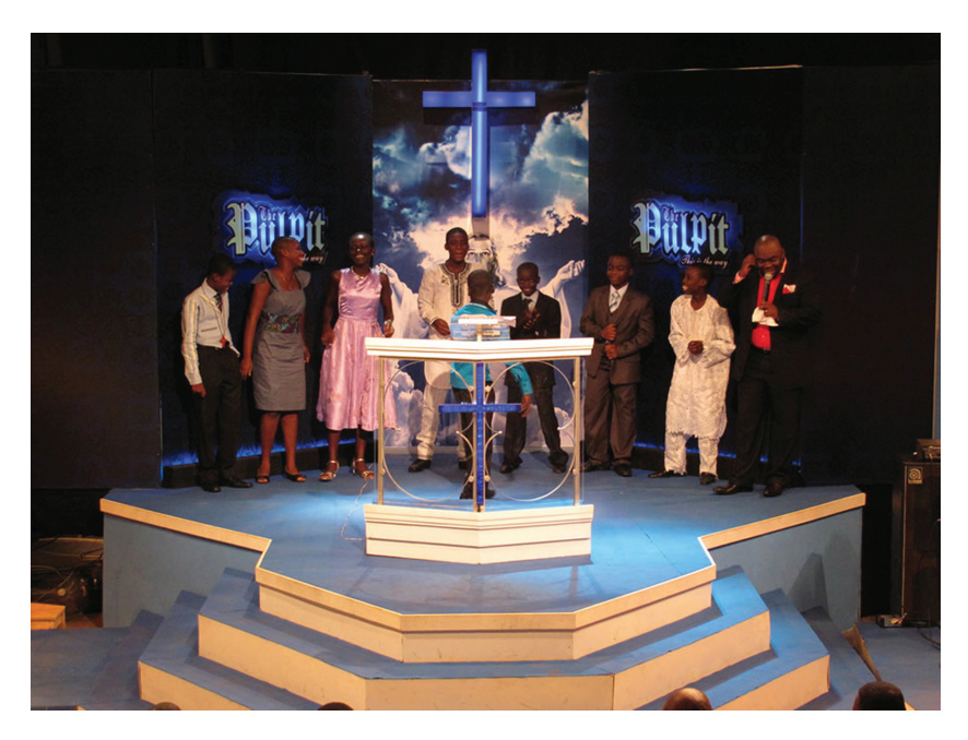
Figure 2: Candidates and host on stage in The Pulpit, TV3, 2011.

the Gospel vein.'<sup>30</sup> He believes that Christianity has to be repackaged to suit modern times and sees himself primarily as an apostle to the youth. Apart from helping colleague gospel singers to record their music, presenting The Pulpit show was an excellent opportunity for him to pursue this aim.