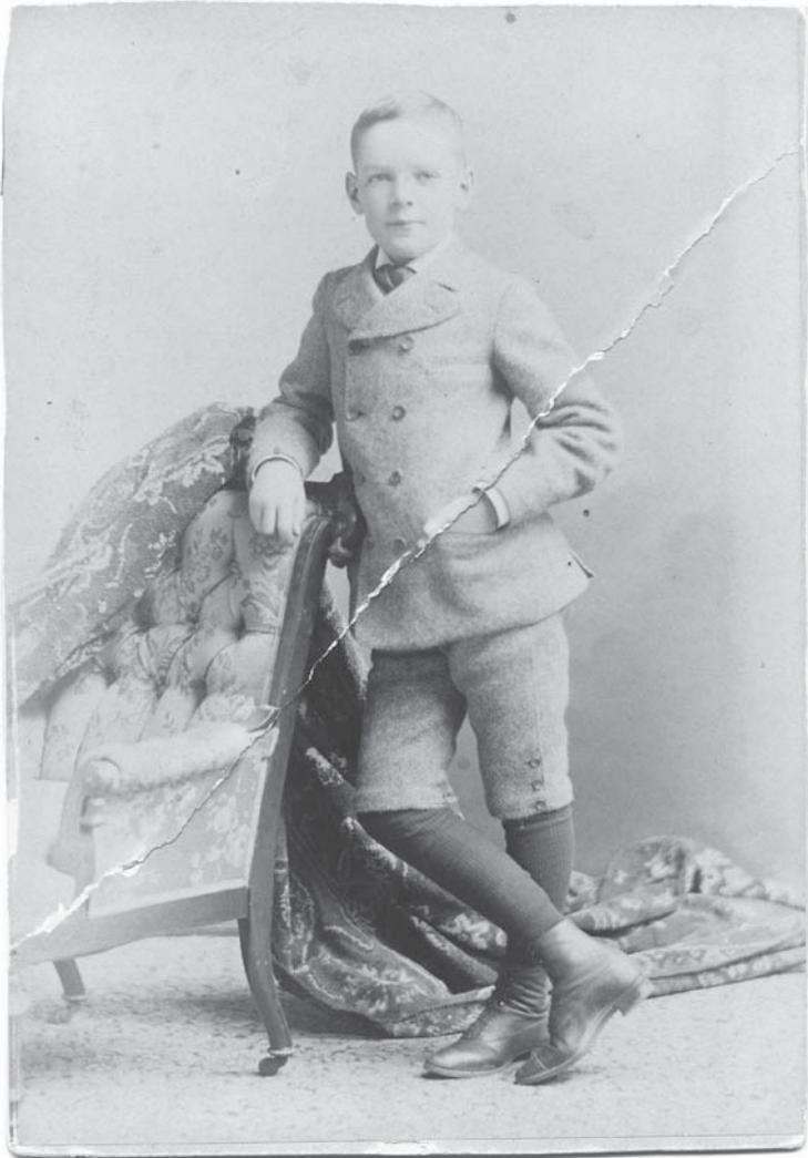
1. Upton Sinclair at eight years old, in 1886. Upton Sinclair was born on September 20, 1878, in Baltimore, Maryland, where he grew up in a series of boardinghouses.