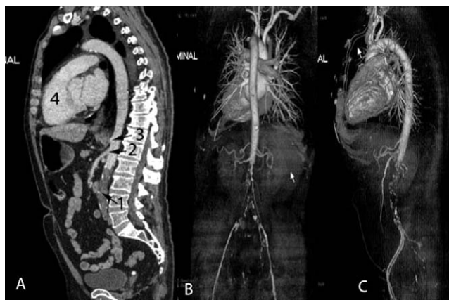
Fig. 1. CT scan, in early arterial phase, shows a total occlusion of the infrarenal aorta including, both left and right common iliac arteries. Superior mesenteric artery and celiac trunk were not occluded. (A) The 3D reconstruction of the late arterial phase of CT scan shows from the posterior (B) and lateral (C) view the occlusion of the abdominal aorta. 1: Embolus in infrarenal aorta, 2: superior mesenteric artery, 3: coeliac trunk and 4: right ventricle.

A 50-year-old patient with acute paresis, paralysis and the absence of femoral pulses in both legs was admitted to emergency. Computed tomography (CT) scan revealed a total occlusion of infrarenal abdominal aorta and of the iliac arteries (Fig. 1). Thrombus in the left ventricle as the source of embolus (Fig. 2) was identified.