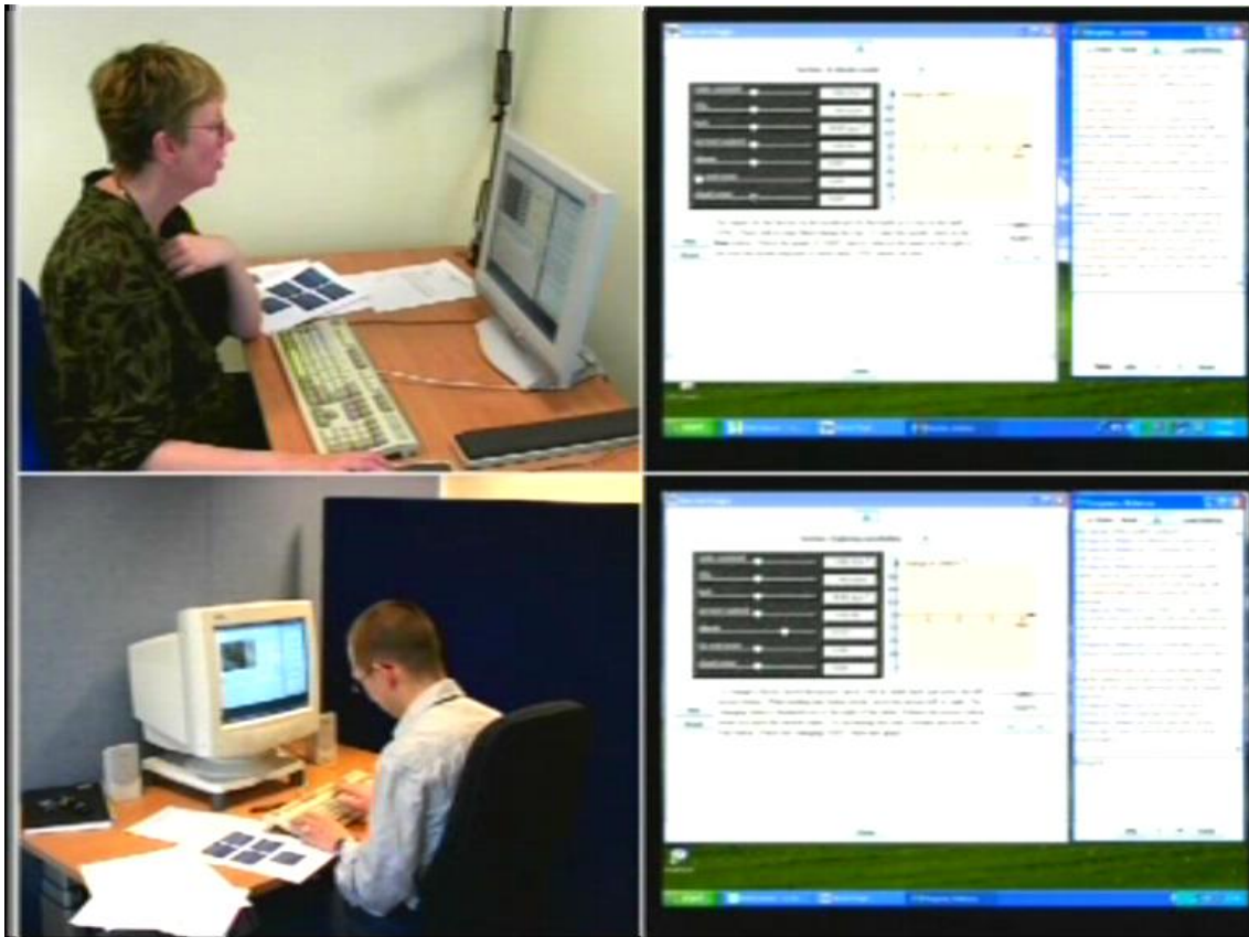
Figure 2. Two users working collaboratively with a shared screen at a distance using the Global Warming application

was happening but felt pressurised to respond more quickly as she imagined the other person waiting for a response. However she did concede that once you get to know your partner this was not so much of a difficulty. Working collaboratively forced the students to make explicit their reasoning behind their decisions to alter certain variables and they believed they overcome some of their initial misconceptions about the topic. Discussion also helped them to make sense of the feedback given by the Global Warming simulation. The important take-home message from this development is that these types of interactive assessments do promote reflection and the technological pull is starting to address the pedagogical push for designing holistic e-assessment.