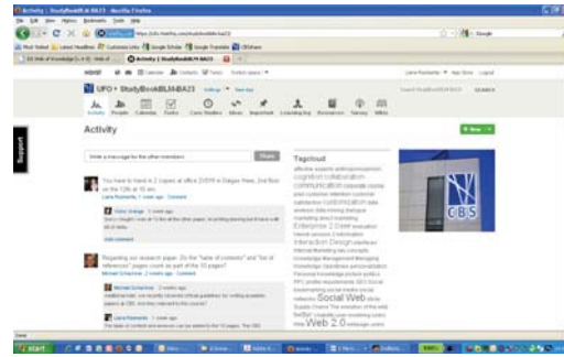
Figure 1: Screenshot of the StudyBook platform.

project work had to be constructed collaboratively using wikis and afterwards had to make a presentation. 2) Work individually: In the second step, students have to continue to work on the selected topic individually in order to write a ten page report that will be graded.