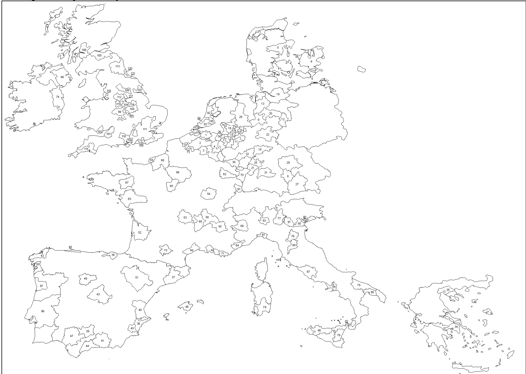
Appendix 2 Figure 1: Map of the Major FURs in EU12