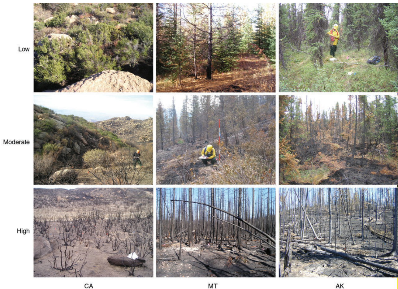
Fig. 1. Low, moderate, and high 'burn severity' sites in California (CA) chaparral, Montana (MT) mixed-conifer forests, and Alaska (AK) black spruce forests. Burn severity was classified via consistent visual assessment of ground and canopy fire effects.

correlations between field and remotely sensed measures of burn severity to post-fire wind and precipitation events that may have transported ash and soil off-site following fire in chaparral systems in southern California.