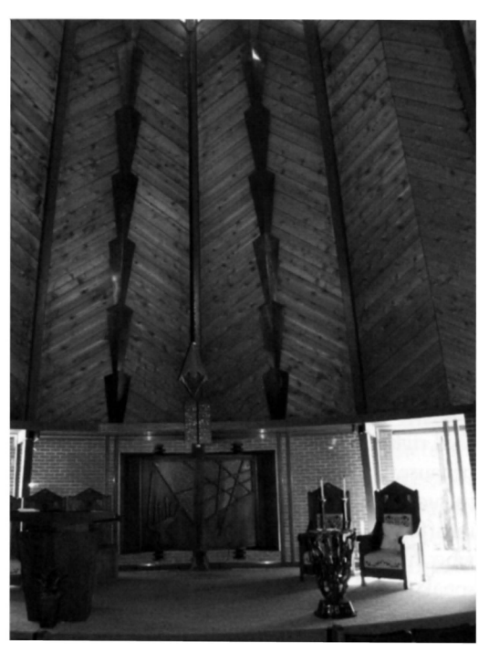
FIG. 5. Interior of Temple Emanu-El.

While Hebrew Congregation's younger generation wrestled with maintaining Jewish observance, Emanu-El's members struggled to live up to the activist heritage of Rabbi