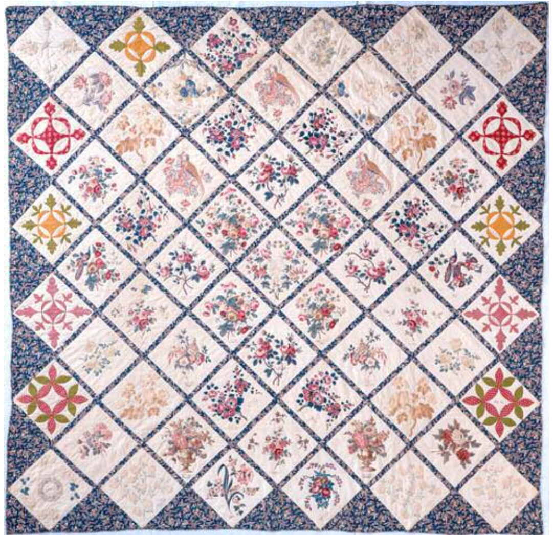
Floral Album. 107" x 105.5"

The University of Nebraska–Lincoln Department of Textiles, Clothing & Design and the IQSC jointly sponsor a master's degree program in textile history and quilt studies. For more information go to http://www.quiltstudy.org/index.html then click on Education and Research.