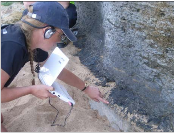
Figure 3. An example of a netbook's in built web camera and VoIP softphone being used to show a remote student some details from a field site.