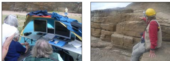
Figure 5. Remote fieldwork set up at Howick Haven (part of the Durham residential school in August 2009).

Alongside a one week residential school in Durham, four ERA researchers spent a week field testing and developing the local wireless network configuration and VoIP services. At the beginning of the week we worked at two separate field locations to explore the suitability of VoIP and video to support remote access for one of the OU courses. After further tests at other field locations, we finished the week by working with a demonstrator and tutor to help a group of eight mobility impaired students to complete part of the course using the remote access toolkit (see Figure 5).