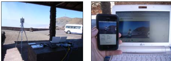
Figure 7. ERA local network, IP video camera, web server and clients used in Nicaragua.

We were unable to source a 3G broadband SIM card or USB dongle in Nicaragua, although advertised online they were only recently released and were unavailable in the Masaya region at the time of the trip. The hotel ADSL link was comparable to that available in the UK and supported file transfers as well as Skype voice and video calls. The BGAN terminal also performed well, and was used on the volcano to send photographs and live video back to the OU, and to make two-way VoIP calls (see Figure 7). Further details (including clips of photograph downloads, video streaming and VoIP calls) are available on the Portable WLAN blog http://projects.kmi.open.ac.uk/era/jawlan/?p=414 (last accessed June 2010).