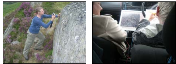
Figure 1. An example of remote fieldwork used on an OU residential geology course. The field geologist shown on the left is taking a photograph for the remote students to work with (shown on the right).

being led by technological innovations. Through use on successive residential schools, developmental trials, and evaluation studies we have also refined our use of the toolkit for learning and teaching (see Section 3).