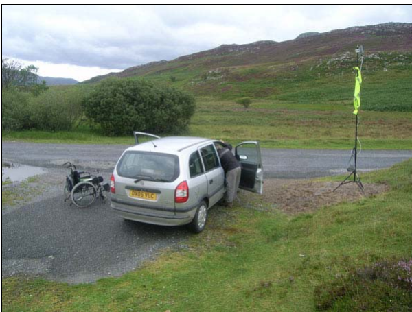
Figure 4. An example of a field location using a Wi-Fi router on a lighting stand to provide a link to the field geologist at the top of the hill.