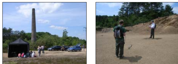
Figure 8. ERA evaluation trial at Devon Great Consols Mine. The remote students and tutor (left) work with the field tutor and camera person (right) to complete a half-day Environmental Impact Assessment (EIA) scoping sheet activity.

The focus of the evaluation trial was to investigate cognitive and affective learning in remote and direct fieldwork. The teaching involved two lecturers taking the students on a tour through a mine and asking them to complete an Environmental Impact Assessment activity (see Figure 8). In the direct fieldwork sessions, the students worked alongside the two lecturers in the field, and in the two remote sessions the students stayed in the car park at the mine with one tutor. They spoke to the other tutor (as a single group) using a VoIP phone with a loudspeaker that everyone could hear and a single shared microphone. The tutor's tour was watched by the students on a single 24-inch LED screen, which displayed a live video stream from a camcorder connected to a video encoder carried by the research officer.