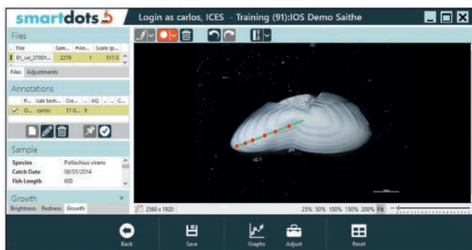
Fig. 2 - SmartDots software was initially developed at ILVO (Institute for Agricultural and Fisheries Research) in Belgium. Since 2017 SmartDots is an open source solution published on GitHub.