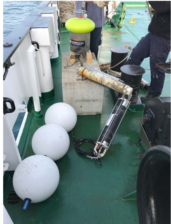
Figure 2. Underwater sound measuring chain prior to deployment from RV Belgica. A C-POD (acoustic porpoise detector) is added to the mooring (next to the acoustic release). A pop-up buoy (far end) is used for recovery of the concrete block.

surface marker was left on site to reduce navigation risk inside the construction zone as well as to avoid any perturbing sound originating from a line linking a surface buoy to the mooring.