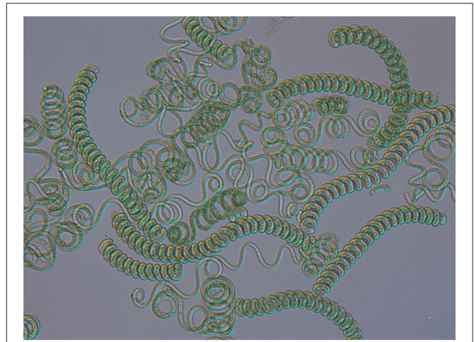
FIGURE 1 | Light microscopy of Arthrospira filaments from natural environment (magnification 200x).

The DNA content of the dry biomass of Arthrospira varies from 0.6 to 1%, which is similar to other unicellular cyanobacteria, but significantly lower than other bacteria or yeast (4–10%). The guanidine plus cytosine content is in the range 44–45 mol%. The average size of the Arthrospira genomes is 6.1 Mbp (Ciferri, 1983; Fujisawa et al., 2010; Cheevadhanarak et al., 2012; Lefort et al., 2014). In addition, the biomass of Arthrospira is rich in substances such as polysaccharides and polyphenols that are very difficult to remove during the DNA isolation process (De Philippis and Vincenzini, 1998; Morin et al., 2010). Apart from the low content of nucleic acids in its dry biomass, Arthrospira genomes seem to lack non-chromosomal