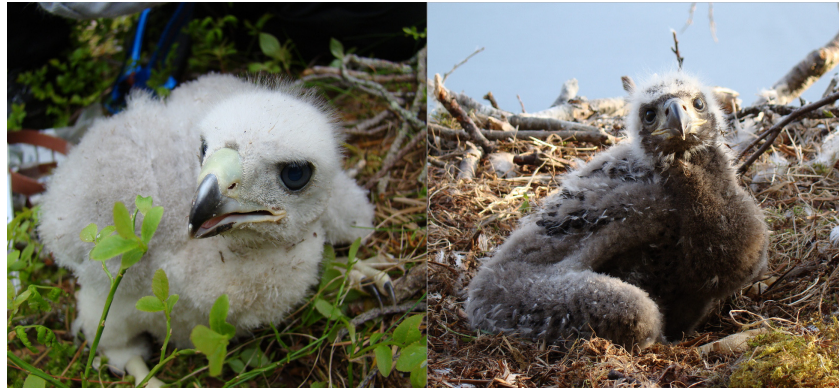
Figure 1. Northern goshawk Accipiter gentilis (left) and white-tailed sea eagle Haliaeetus albicilla (right) nestlings.

(anti-ecto, anti-endo). We investigated the treatment effects on plasma (1) total antioxidant capacity (TAC; an index of nonenzymatic circulating antioxidants), (2) total oxidant status (TOS; a measure of plasma oxidants), and (3) immunoglobulin levels (a measure of humoral immune function). We predicted that treatment against ecto- and endoparasites would reduce the plasma levels of immunoglobulins, as alleviating levels of infectious organisms should ease up the antibody response. As immune responses are costly, both directly in terms of energy and nutrients and indirectly as they may increase oxidative stress (OS), we expected that antiparasite treatments would reduce oxidant levels and increase antioxidant levels. Furthermore, we expected birds treated against both endo- and ectoparasites to have the lowest immunoglobulin and oxidant levels, indicating better health than the other treatment groups.