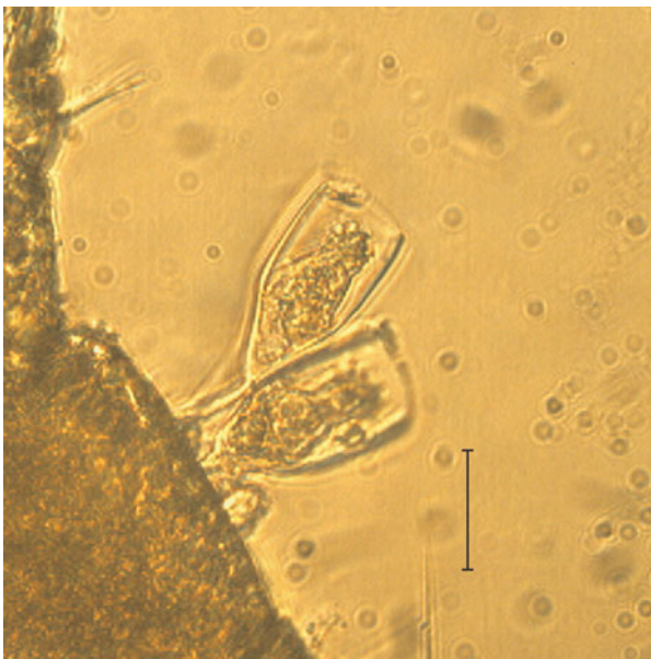
Fig. 2. Praethecacineta halacari attached to Copidognathus sp. from Taiwan. Scale bar 20 \mu m.