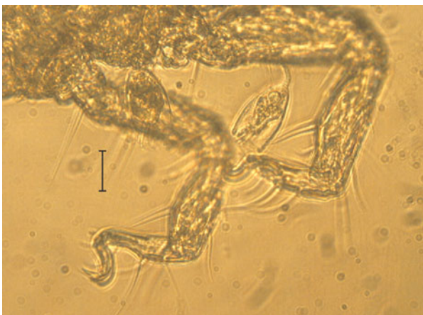
Fig. 3. Praethecacineta halacari attached to Copidognathus ungujaensis Chatterjee, De Troch & Chang from Zanzibar, Tanzania. Scale bar 20 \mu m.