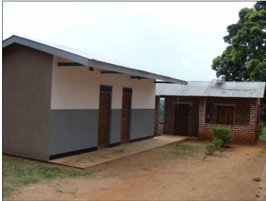
Example of new comprehensive care and treatment centres for HIV/AIDS

and funds. IMCI is poorly integrated into routine supervision and often routine checklists are not available. “If people are just left without any supervision, at first they might try to be serious but