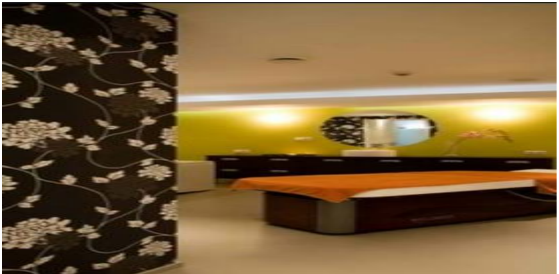
Picture 4a. Spa treatment room