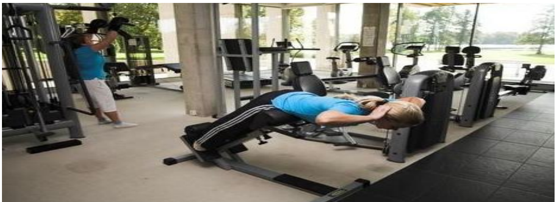
Picture 5c. Customers using the gym services