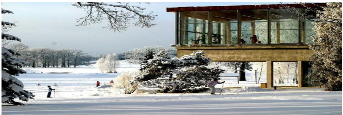
Picture 2b. Surrounding view of PSHR in winter