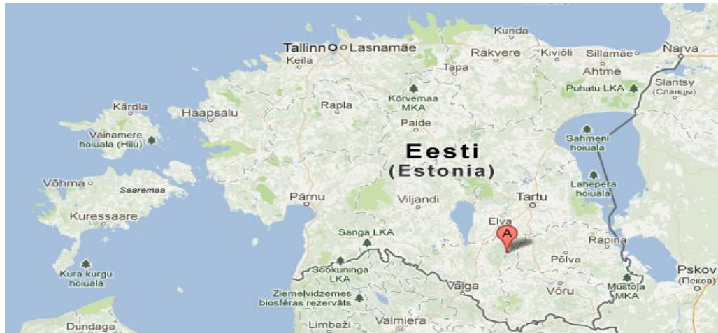
Picture 1. Location of Puhajarve Spa and Holiday Resort.