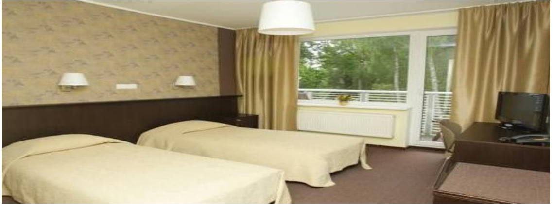
Picture 3. Common room type.