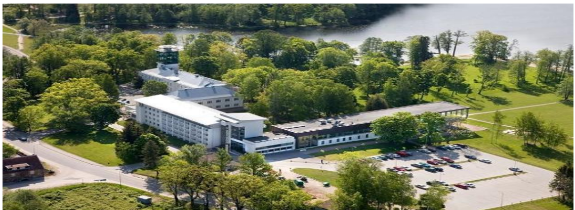
Picture 2a. Aerial view of PSHR in summer