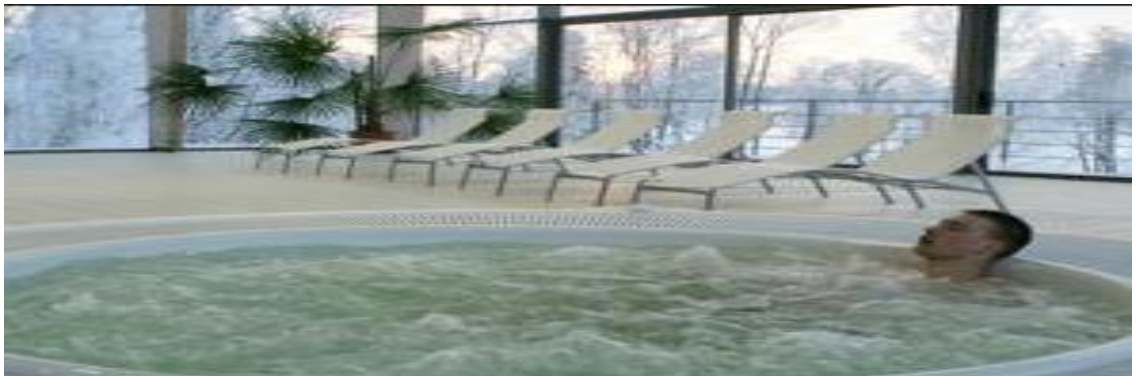
Picture 5b. Customer enjoys Jacuzzi services