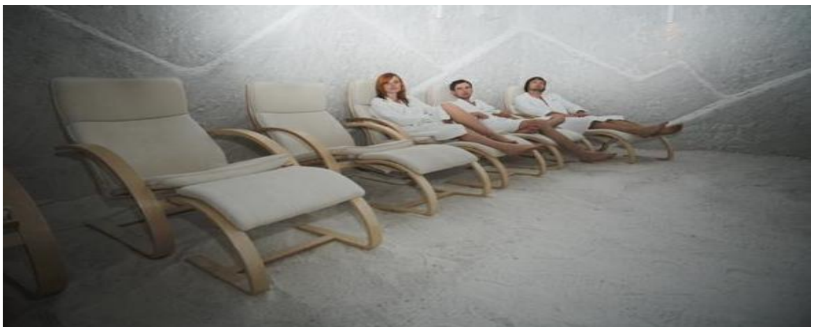
Picture 4b. Salt room with customers