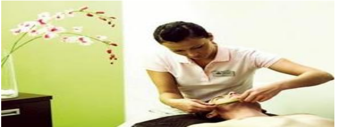
Picture 5a. Customer taking treatment.