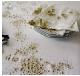
FIG. 5. DISOBEYING AESTHETICAL RULES: SEMANTIC VALUES (MEZZADRO BY ACHILLE AND PIER GIACOMO CASTIGLIONI, DESIGNED IN 1957 AND PRODUCED BY ZANOTTA IN 1971), PERFECTION (COFFEE AND CIGARETTE BY JULIE KRAKOWSKI, AUTOPRODUCTION, 2006).