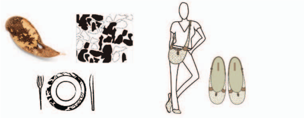
FIG. 10. ZOOM IN ON NATURE, BENCHMARKING AND CONCEPTUAL PROPOSAL.