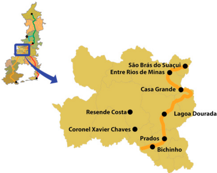
FIG. 2. SELECTED STRETCH INSIDE OF THE ESTRADA REAL COMPLEX, IN THE TOURISTIC REGION OF VERTENTES, FOR THE ACTIONS OF THIS PROJECT.

The projectual method adopted for this work had as focus the meta-project and the systemic design, associated with the participative methodology. The objective was to develop proposals of actions that can be appropriated by the territory's community, what is a fundamental aspect to promote the continuity, and, therefore, to give sustainability throughout those who are part of it. All the information that has lead us to the elaboration of the presented proposals were obtained and/or verified with the communities situated at the selected pilot stretch: São Brás do Suaçuí, Entre Rios de Minas, Lagoa Dourada, Resende Costa, Coronel Xavier Chaves, Prados and Bichinho (Figure 2).