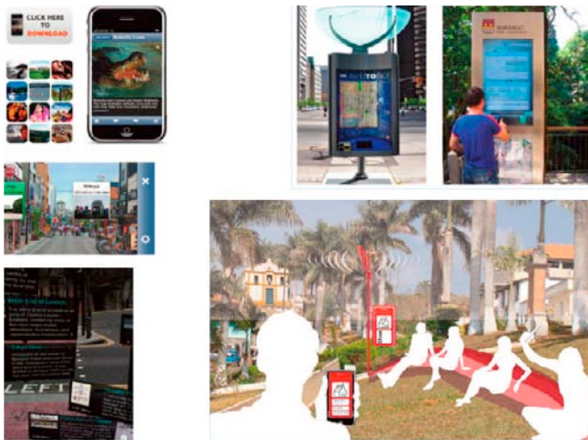
FIG. 6. ER NET, BENCHMARKING AND CONCEPTUAL VISUALIZATION.

Context / Squares: In general terms and in the studied region, squares are public urban meeting spaces, frequently linked to cultural religious aspects, but also related to commercial, administrative and civic activities. Urban furniture: concerns distribution, appearance and functionality in public or private outdoor areas. Contributes to the development and well-being of the population. Focuses on how people live and use the urban space, targeting economical development and strengthening of the local culture (Figure 6).