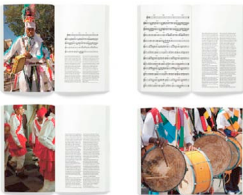
FIG. 9. THE BOOK OF MUSICAL TRADITIONS, BENCHMARKING AND CONCEPTUAL PROPOSAL.

In order to reach the best format to configure the Book of Musical Traditions, several books were analyzed through various scopes, such as formats, contents and organization of the information (Figure 9).