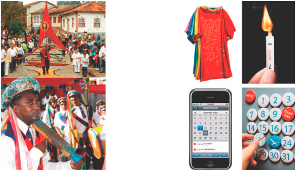
FIG. 5. THE CALENDAR, BENCHMARKING AND CONCEPTUAL PROPOSAL.

To develop the Calendar project, it is necessary to have full knowledge of all existing events in the region. It is also necessary to analyze the available media formats and to promote the interfacing with other proposals of the Project: Design and Competitive Integration in the Estrada Real Territory. Based on this information, it is possible to build models capable of fulfilling all the calendar needs for both, digital and printed promotional products (Figure 5).