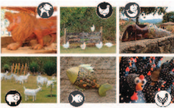
FIG. 3. SOME SAMPLES OF MANY OF THE VARIOUS CRAFTSMEN AND ARTIST EXPRESSIONS THAT CAN BE FOUND IN THE RESEARCH AREA.

The context is local handicrafts. The proposal is justified by the fact that there is already expressive craft work representing the regional fauna (Figure 3). There is also natural diversity to be explored, presenting a vast range of opportunities to be developed with craftsmen and artists of the region (Figure 4).