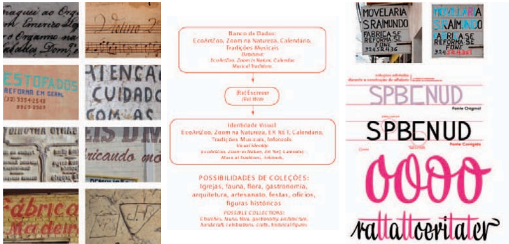
FIG. 8. THE (RE)WRITE, BENCHMARKING AND CONCEPTUAL PROPOSAL.

can be used as a rich source of inspiration to formal design.” - Finizola, Fátima (2009).