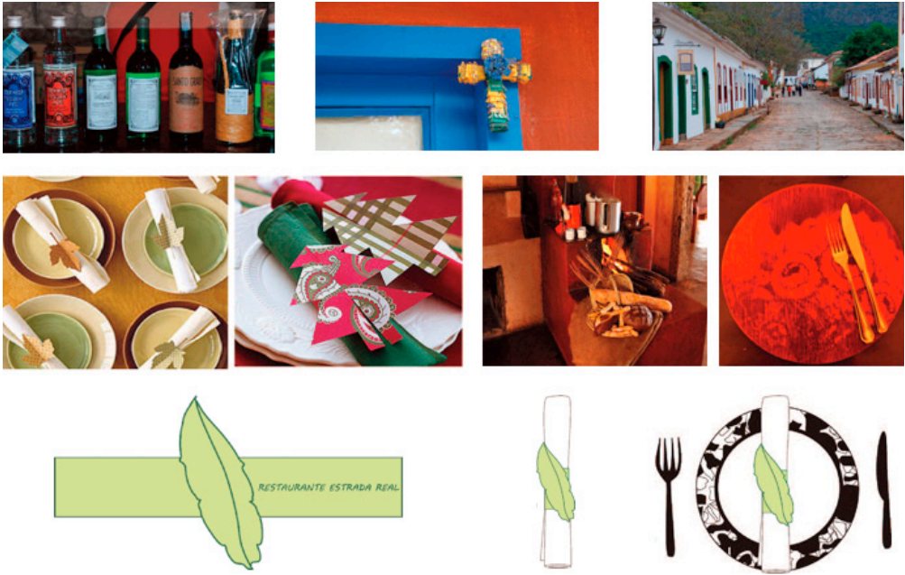
FIG. 7. THE INFO-TOOLS, BENCHMARKING AND CONCEPTUAL PROPOSAL.

The Info-tools project targets tourists, Brazilian and foreigners, who visit the region willing to experience to the maximum its peculiarities and attractions – specially those with autonomy to make slight changes on their itinerary and that are interested in taking home items that refer to their experience while traveling (Figure 7).