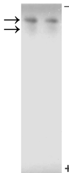
Fig. 2. Zymogram detection of trypsin-like enzymes in crude anterior midgut extract of M. funereus larvae after IEF and transfer onto NC membrane. The arrows indicate the position of basic trypsin-like enzymes. (-) pI 10, (+) pI 3.