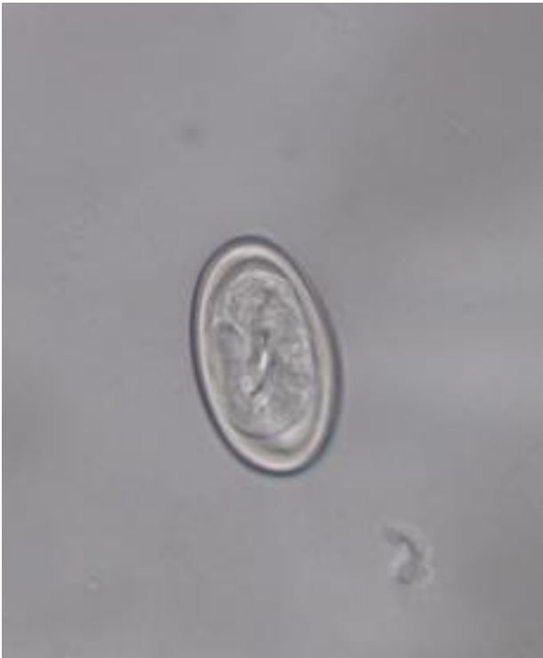
Fig. 1. A. A typical egg of Mastophorus muris . Magnification x 80.

lus with higher prevalence (3.02%). Milazzo et al. (2003) examined 44 adult specimens of M. musculus in Sicily and Corsica and found the prevalence of M. muris to be 11.36%.