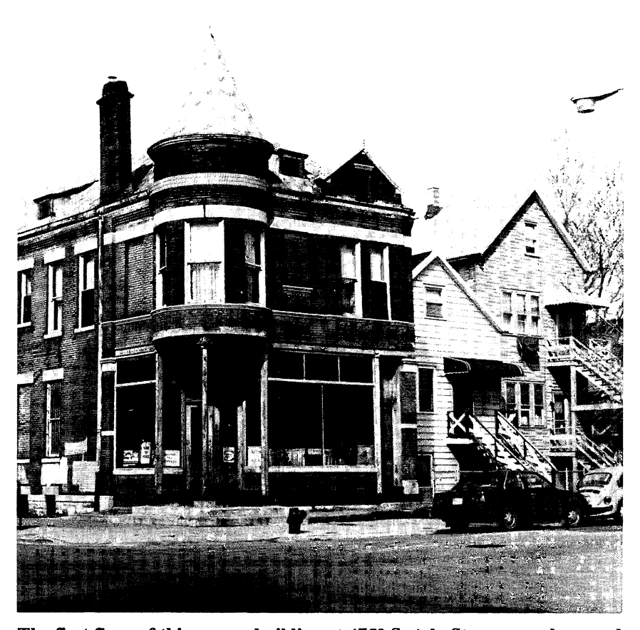
The first floor of this corner building at 4758 S. Ada St., was a saloon and meeting hall. The workingman's cottage and two-story apartment to the right were typical of the structures canvassed by Sophonisba Breckinridge and Edith Abbott in 1909.

one-quarter of the people living in those structures were lodgers. <sup>88</sup> Breckinridge and Abbott, like most middle-class Americans, disapproved of the immigrant practice of taking lodgers or boarders, but they understood that those families had lived in close quarters in their homelands and that the additional income helped them achieve their goal of home ownership. Thus the houses and the occupants, they said, were like immigrant working-class districts elsewhere in Chicago and in other cities; Back of the Yards was "a typical and not an exceptional neighborhood."<sup>89</sup>