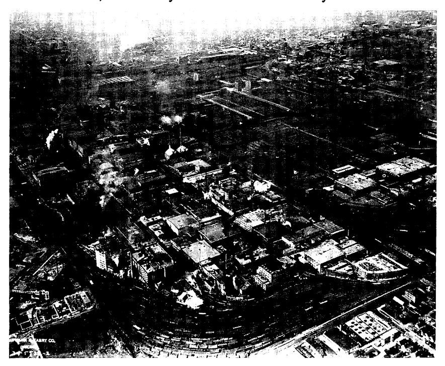
1924 aerial view of the industrial square mile containing the stockyards, packinghouses (or Packingtown) and railroad tracks. Since the direction of the camera was northeast, the photographer did not catch the residential area known as Back of the Yards.

Sinclair was an only child, born in Baltimore in 1878 to an alcoholic father and a pious mother who disapproved of Demon Rum. In "a series of Cinderella transformations," he was shunted between vermin-infested boardinghouses that his father could afford and the fashionable homes of maternal relatives. While studying at City College and Columbia University, he augmented the family income by selling jokes and adventure stories. He aspired to write the great American novel, but his early efforts were overlooked by critics and readers.