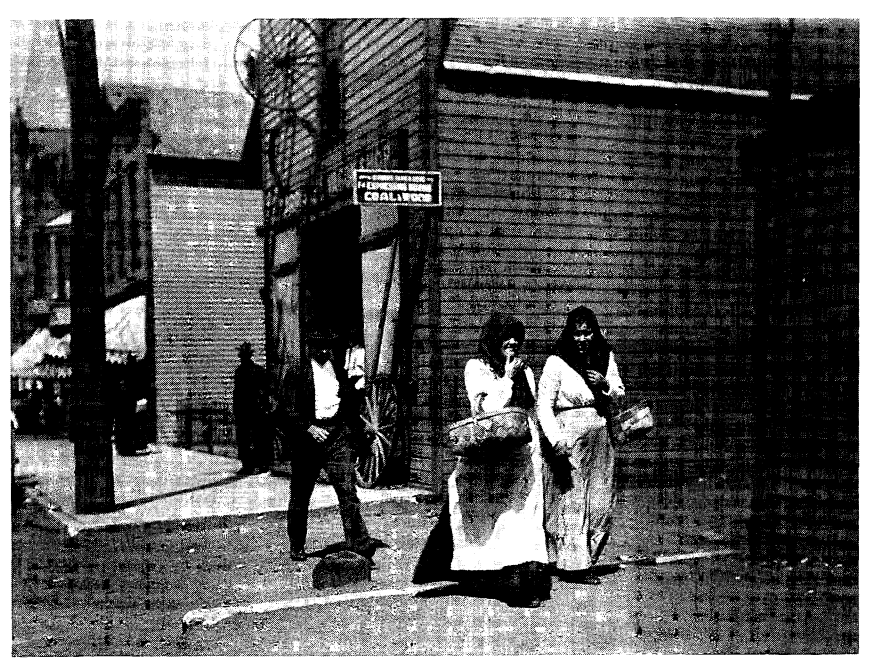
A typical shopping street scene in Back of the Yards, taken in 1904 by a Chicago Daily News photographer during the stockyards strike.